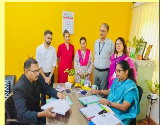
MOU between Mindcraft and M.E.S. Vasant Joshi College of Arts & Commerce