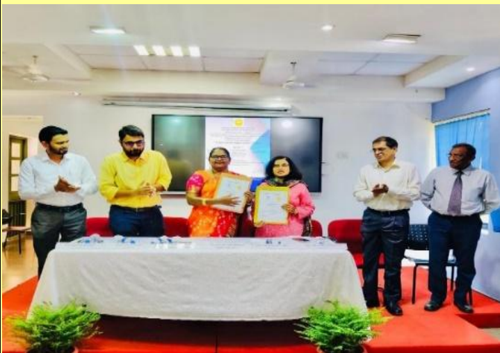
MOU between GCCI and M.E.S. Vasant Joshi College of Arts & Commerce