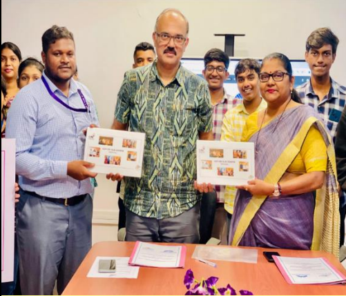
MOU between GDP Foundation and M.E.S. Vasant Joshi College of Arts & Commerce