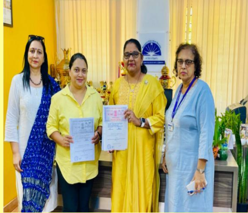
MOU between Rotary Club Vasco Port Town and M.E.S. Vasant Joshi College of Arts & Commerce