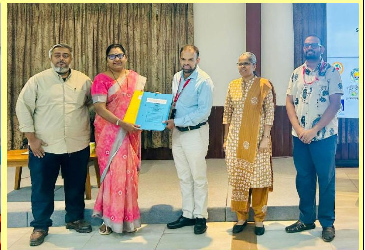
MOU between GIPARD and M.E.S. Vasant Joshi College of Arts & Commerce