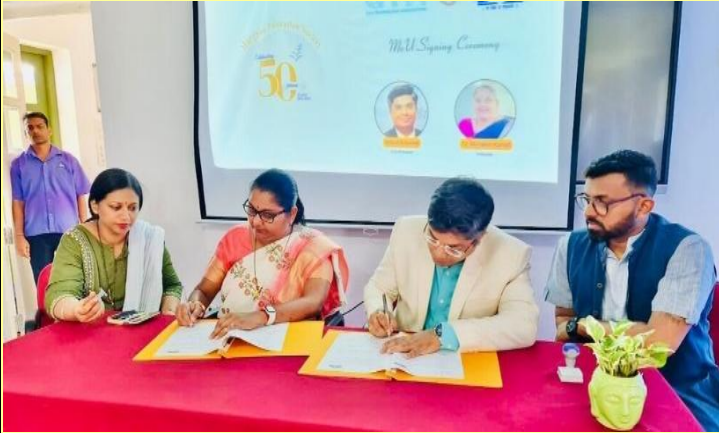
MOU between GTA and MES's Vasant Joshi College of Arts & Commerce