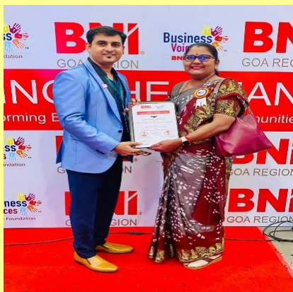
MOU with Business Network International