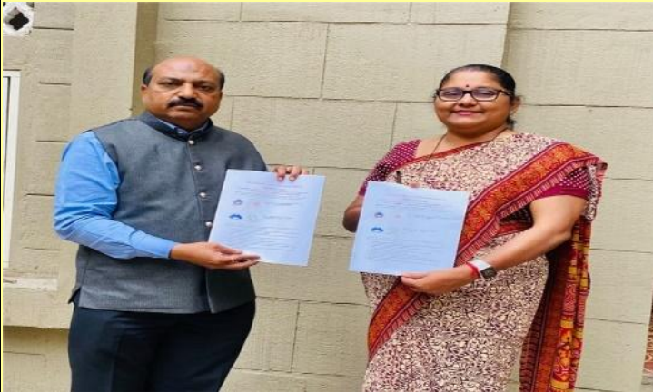
MOU between Poona College of Arts, Commerce & Science and MES's Vasant Joshi College of Arts & Commerce