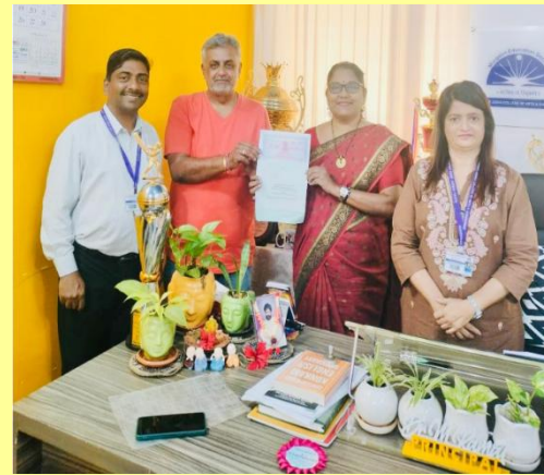
MOU between Sigma training academy and M.E.S. Vasant Joshi College of Arts & Commerce