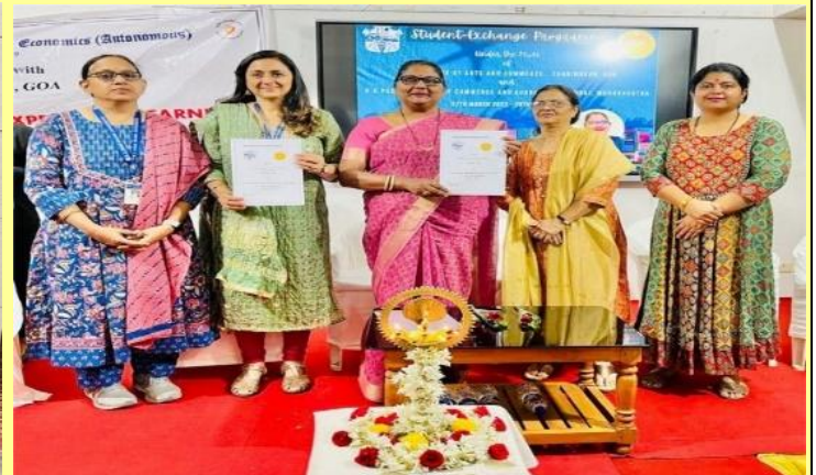
MOU between Podar College, Mumbai and M.E.S. Vasant Joshi College of Arts & Commerce