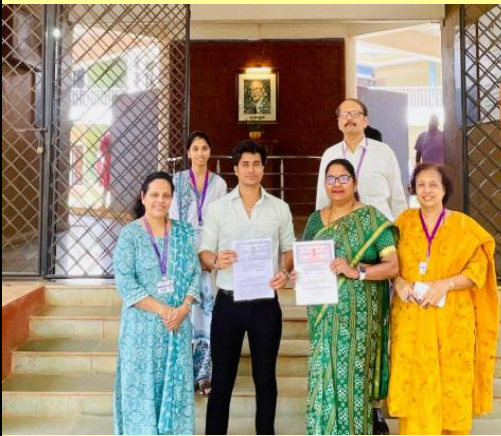
MOU between Empirical F&M Academy and M.E.S. Vasant Joshi College of Arts & Commerce