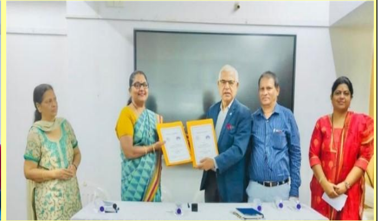
MOU between GMA and MES's Vasant Joshi College of Arts & Commerce