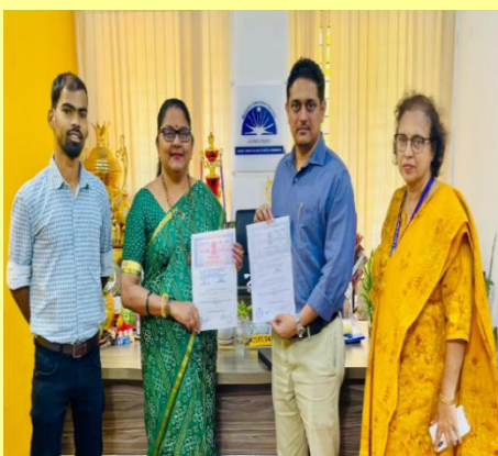
MOU between M/s. Global E waste Management System and M.E.S. Vasant Joshi College of Arts & Commerce