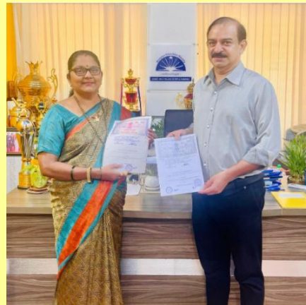
MOU between NAVEMARG and M.E.S. Vasant Joshi College of Arts & Commerce