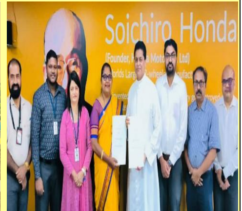
MOU between FIIRE and M.E.S. Vasant Joshi College of Arts & Commerce