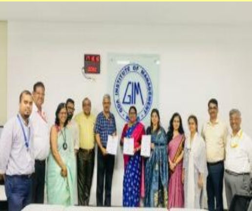
MOU between GIM and M.E.S. Vasant Joshi College of Arts & Commerce