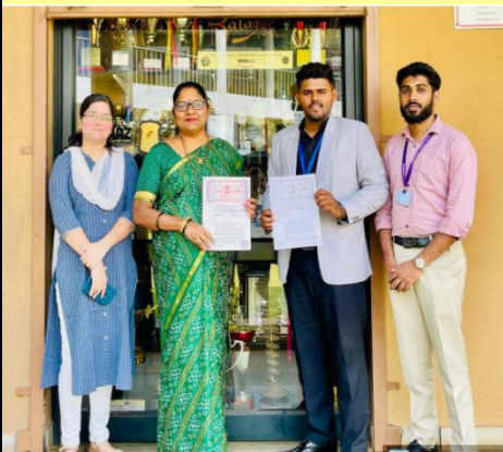
MOU between Wonksknow Technologies India Pvt. Ltd. and M.E.S. Vasant Joshi College of Arts & Commerce