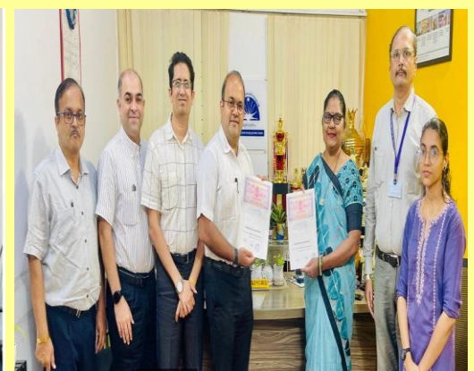
MOU between Global Chamber of Saraswat Entrepreneurs and M.E.S. Vasant Joshi College of Arts & Commerce