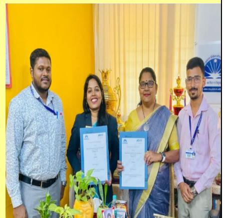
MOU between JCI Vasco and M.E.S. Vasant Joshi College of Arts & Commerce