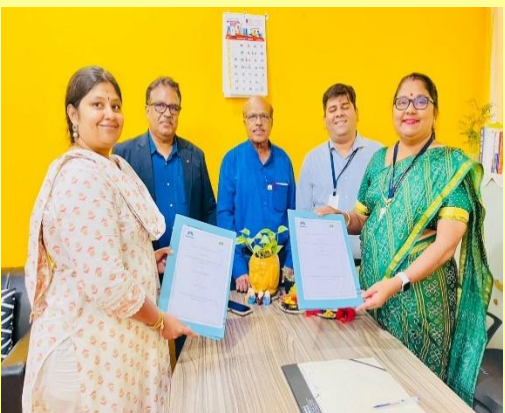
MOU between Lions club of Cortalim and M.E.S. Vasant Joshi College of Arts & Commerce