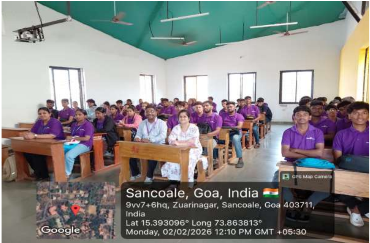
Participants of the session