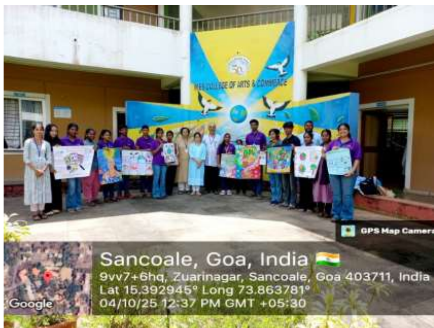
Participants of the session