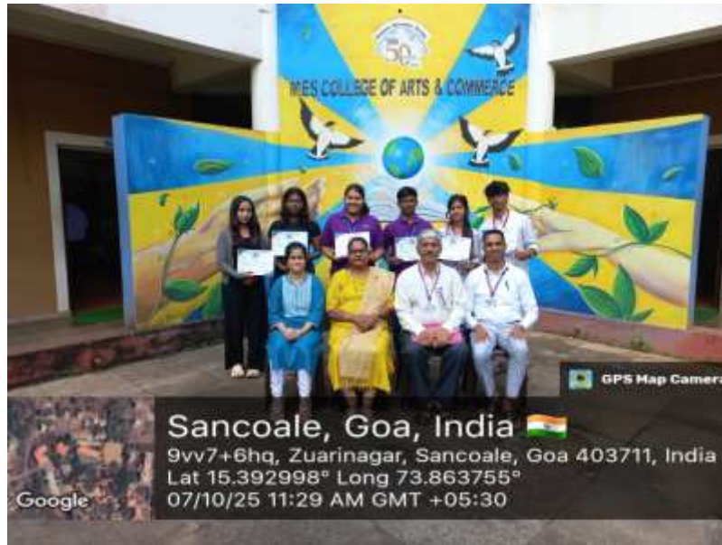
Winners of the session