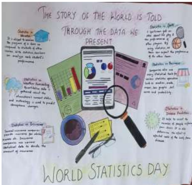
1 st Consolation