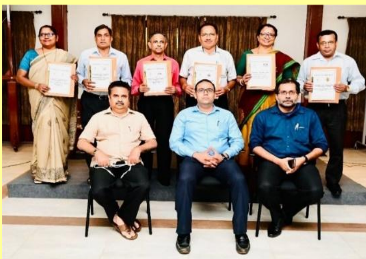
MOU between GIPARD and M.E.S. Vasant Joshi College of Arts & Commerce