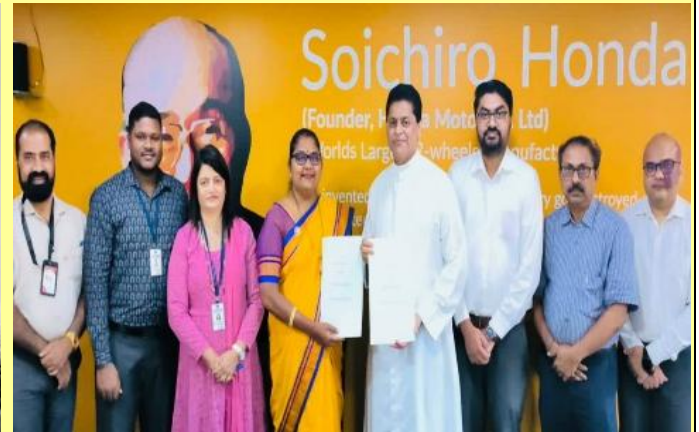
MOU between FIIRE and M.E.S. Vasant Joshi College of Arts & Commerce