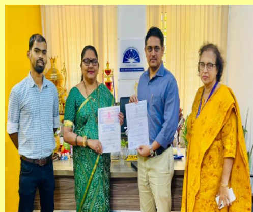
MOU between M/s. Global E waste Management System and M.E.S. Vasant Joshi College of Arts & Commerce