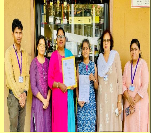
MOU between FERC and M.E.S. Vasant Joshi College of Arts & Commerce