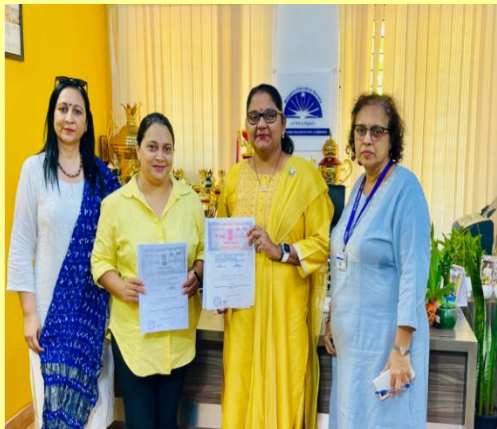
MOU between Rotary Club Vasco Port Town and M.E.S. Vasant Joshi College of Arts & Commerce