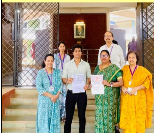
MOU between Empirical F&M Academy and M.E.S. Vasant Joshi College of Arts & Commerce