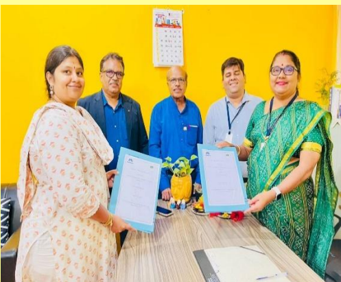
MOU between Lions club of Cortalim and M.E.S. Vasant Joshi College of Arts & Commerce