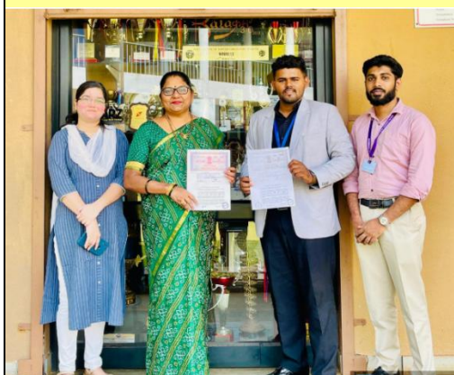
MOU between Wonksknow Technologies India Pvt. Ltd. and M.E.S. Vasant Joshi College of Arts & Commerce