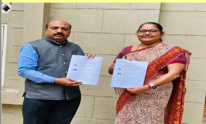
MOU between Poona College of Arts, Commerce & Science and MES's Vasant Joshi College of Arts & Commerce