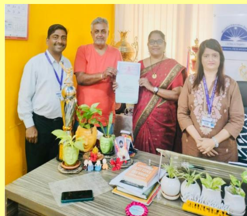
MOU between Sigma training academy and M.E.S. Vasant Joshi College of Arts & Commerce