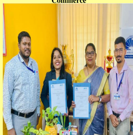
MOU between JCI Vasco and M.E.S. Vasant Joshi College of Arts & Commerce