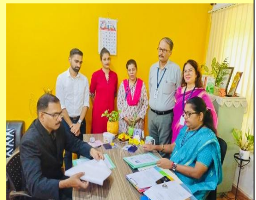
MOU between Mindcraft and M.E.S. Vasant Joshi College of Arts & Commerce