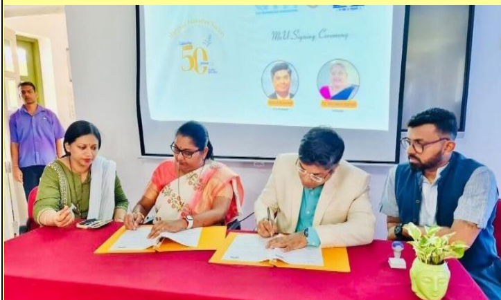
MOU between GTA and MES's Vasant Joshi College of Arts & Commerce