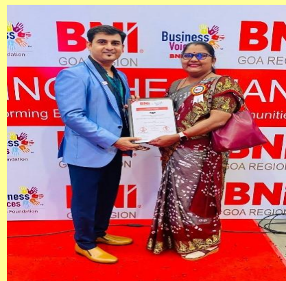
MOU with Business Network International