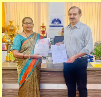
MOU between NAVEMARG and M.E.S. Vasant Joshi College of Arts & Commerce