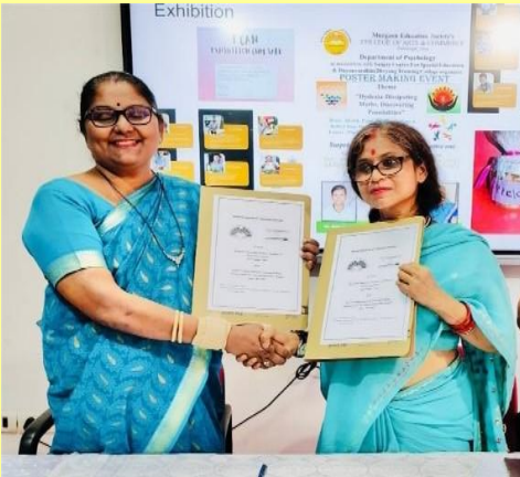
MOU between Dyanvardhini Divang Training College of B.Ed. for Special Education and M.E.S. Vasant Joshi College of Arts & Commerce