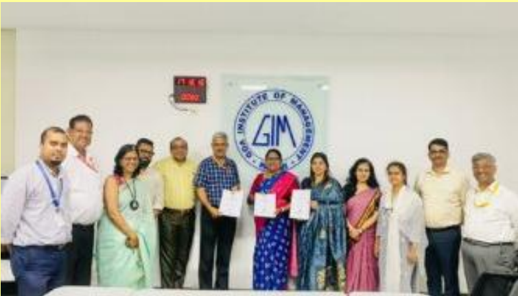
MOU between GIM and M.E.S. Vasant Joshi College of Arts & Commerce