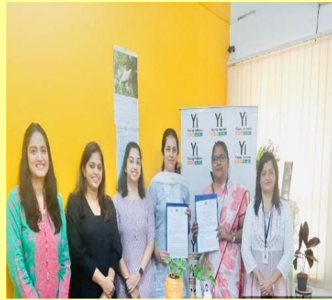
MOU between CII-YI and MES's Vasant Joshi College of Arts & Commerce