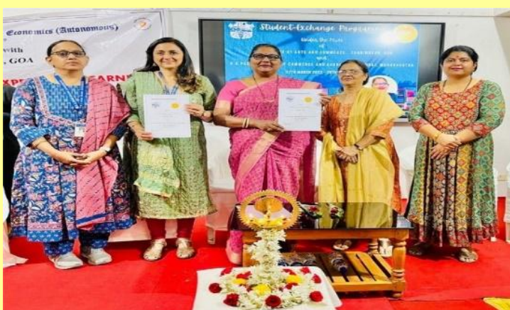
MOU between Podar College, Mumbai and M.E.S. Vasant Joshi College of Arts & Commerce