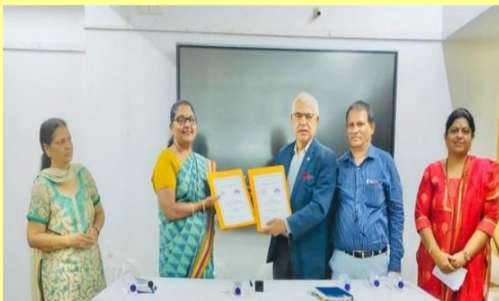
MOU between GMA and MES's Vasant Joshi College of Arts & Commerce