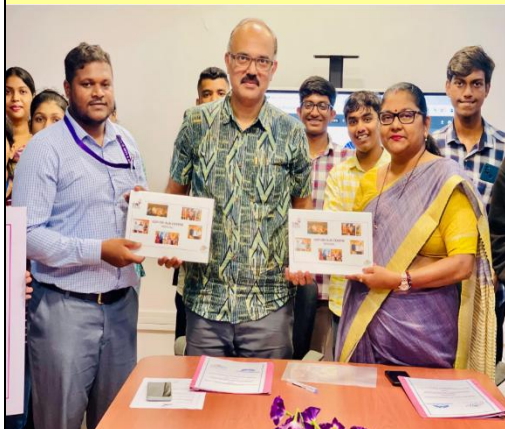
MOU between GDP Foundation and M.E.S. Vasant Joshi College of Arts & Commerce