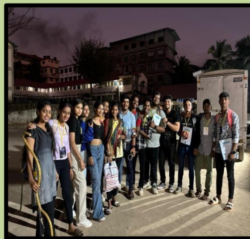
Student won various events at IT Maestro XI Event at S.E.S Sirdora Caculo College of Commerce and Management Studies in Mapusa