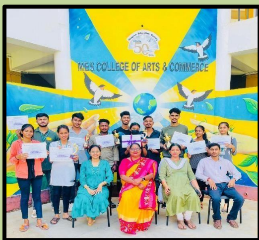
Students have won 1st place for the Event "NOESIS" under the category of Mechmania Showcase and Media Masters organized by Rosary college of Arts and Commerce.