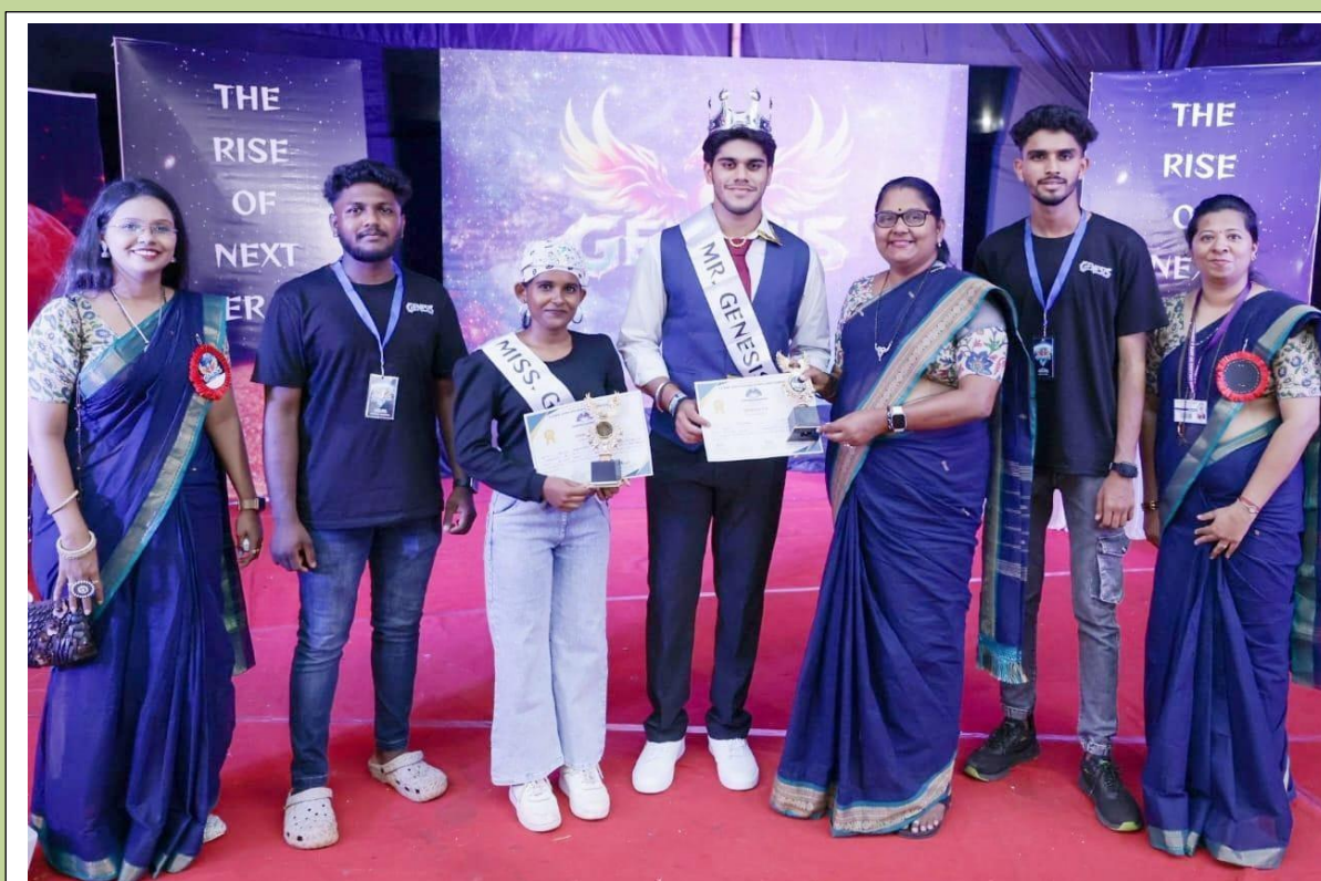
Intercollegiate department event -“GENESIS 7.0”