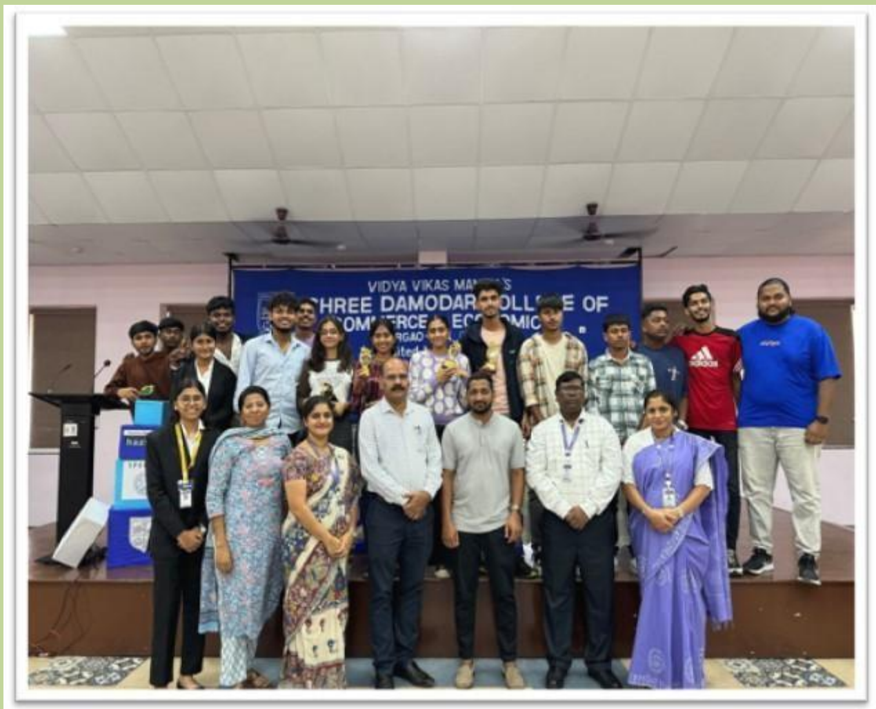
Winners of various competitions held at “Spectra” Intercollegiate event organized by at Shree Damodar College of Commerce & Economics

Note: The above fees are subject to change, as per the Notifications received from Goa University/ DHE from time to time.