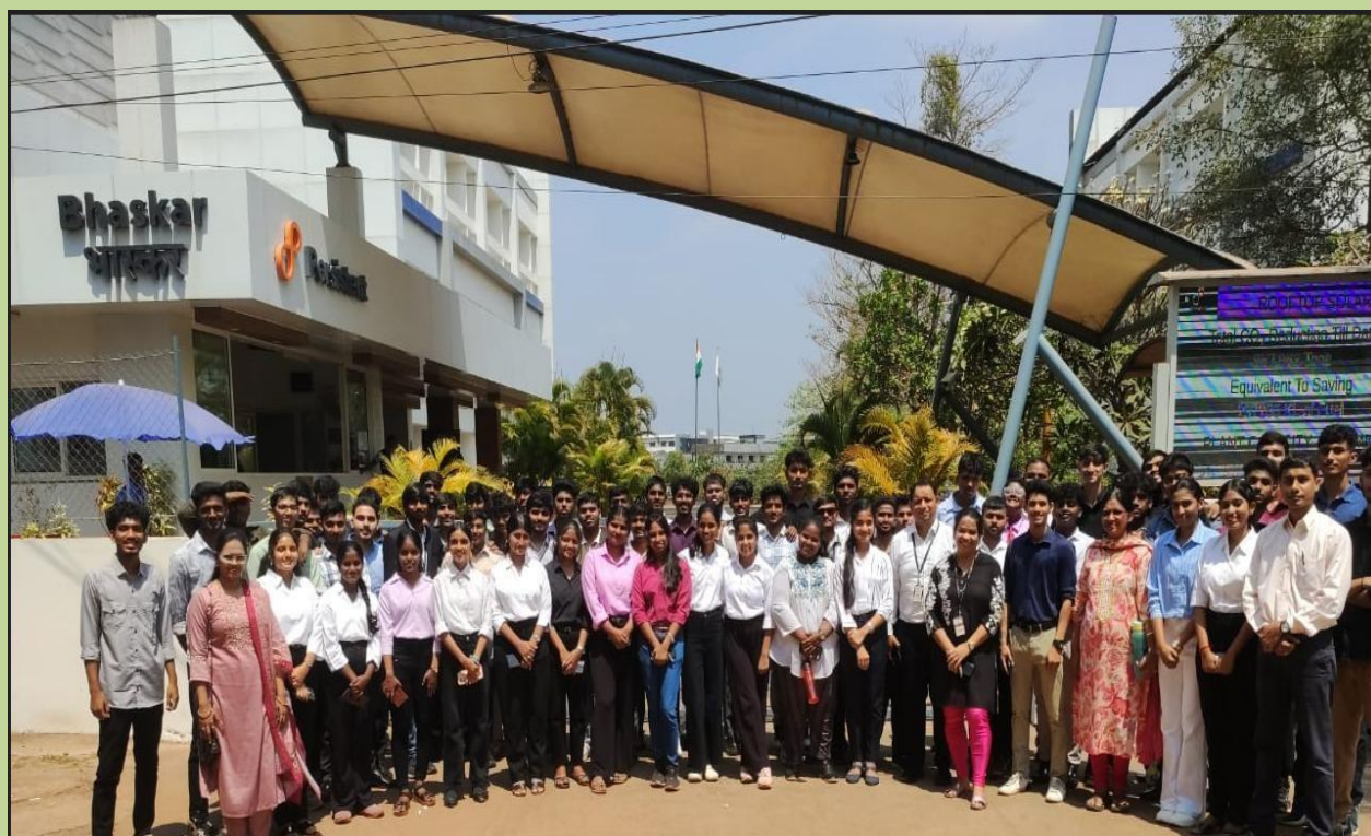
Experiential Learning Visit to Persistent Systems Private Ltd, Verna Goa