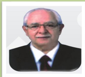
Prof. M. S. Kamat

With boundless pleasure I write this message for our College Prospectus 2025-26. Entire education system in our country is in the midst of massive transformation, regeneration and revamping through the implementation of the celebrated New Education Policy, 2020. The implementation of the NEP 2020 is a herculean task which is rightly being carried out in India in a mission mode, with great enthusiasm, zeal and passion by all stakeholders. It is very heartening to note, all sections of community have, by now, realized that the wellbeing, welfare and happiness of the people of India, in future will be principally determined by the successful implementation of the NEP 2020.