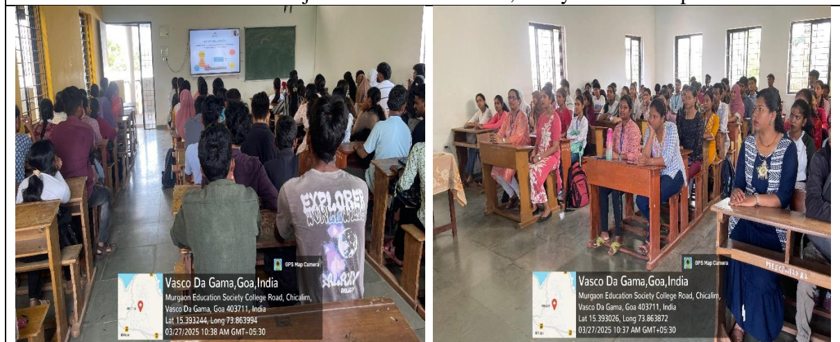
Screening of Yi ‘Train the Trainer’ session on ‘Mental Wellness & Drug Abuse Awareness’ held on 27 th March 2025