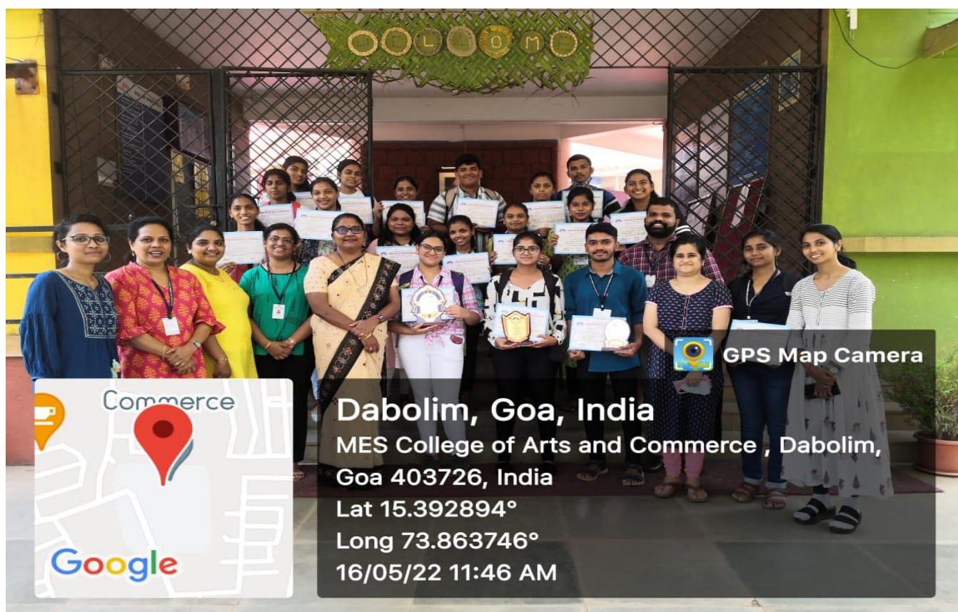
Winners and participants of the Essay Writing Competition

Remarks of the Coordinator: Overall, the competition was a great success. Students got an opportunity to showcase their writing skills.