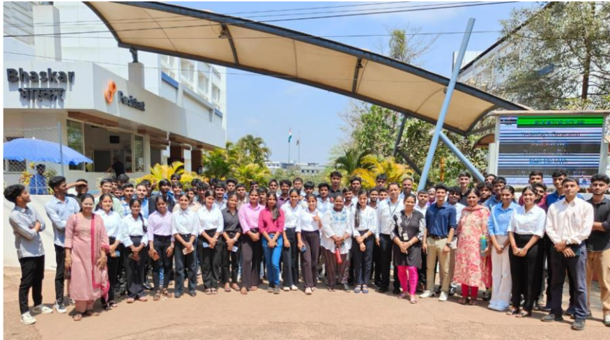
The Department of Computer Application organised an experiential learning trip for the FYBCA students of the B.C.A. program. The students visited The Persistence System on 13 th March 2025.