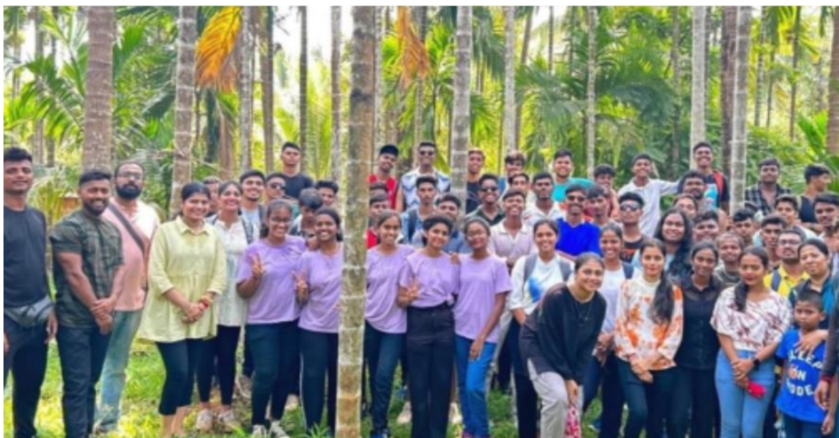
A field trip to Kumthal Village near Valpoi Goa was Organised for the first year students on March 30, 2024.