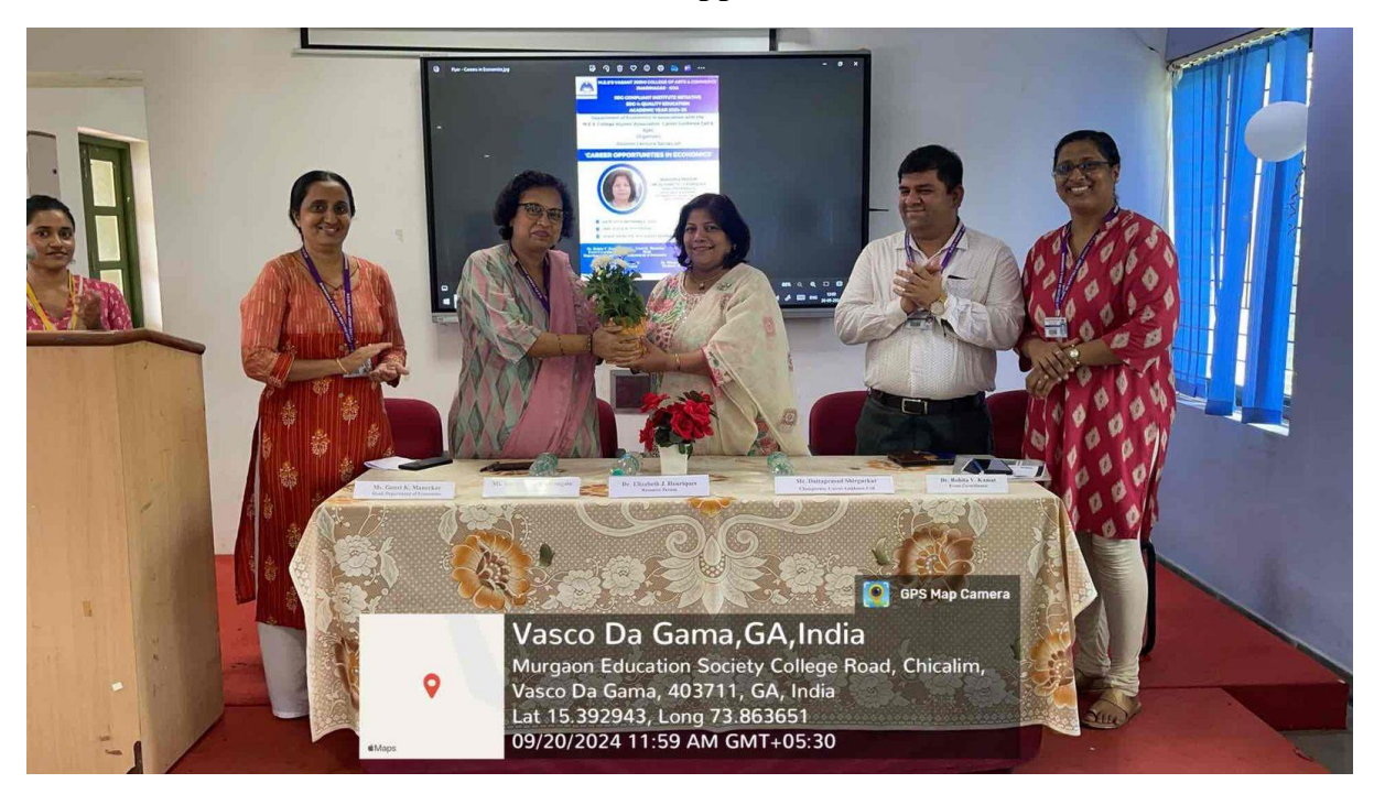
Lecture Series on Career Opportunities in Economics