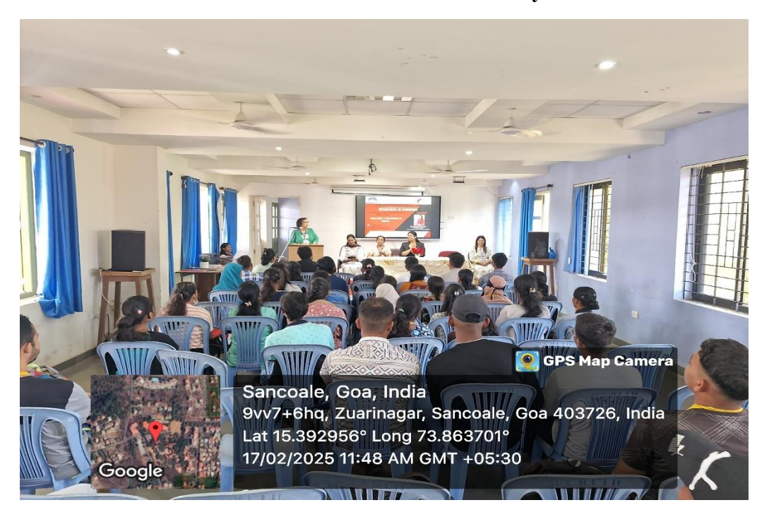
A Session on 'Social Media- A New Doorway to Success'