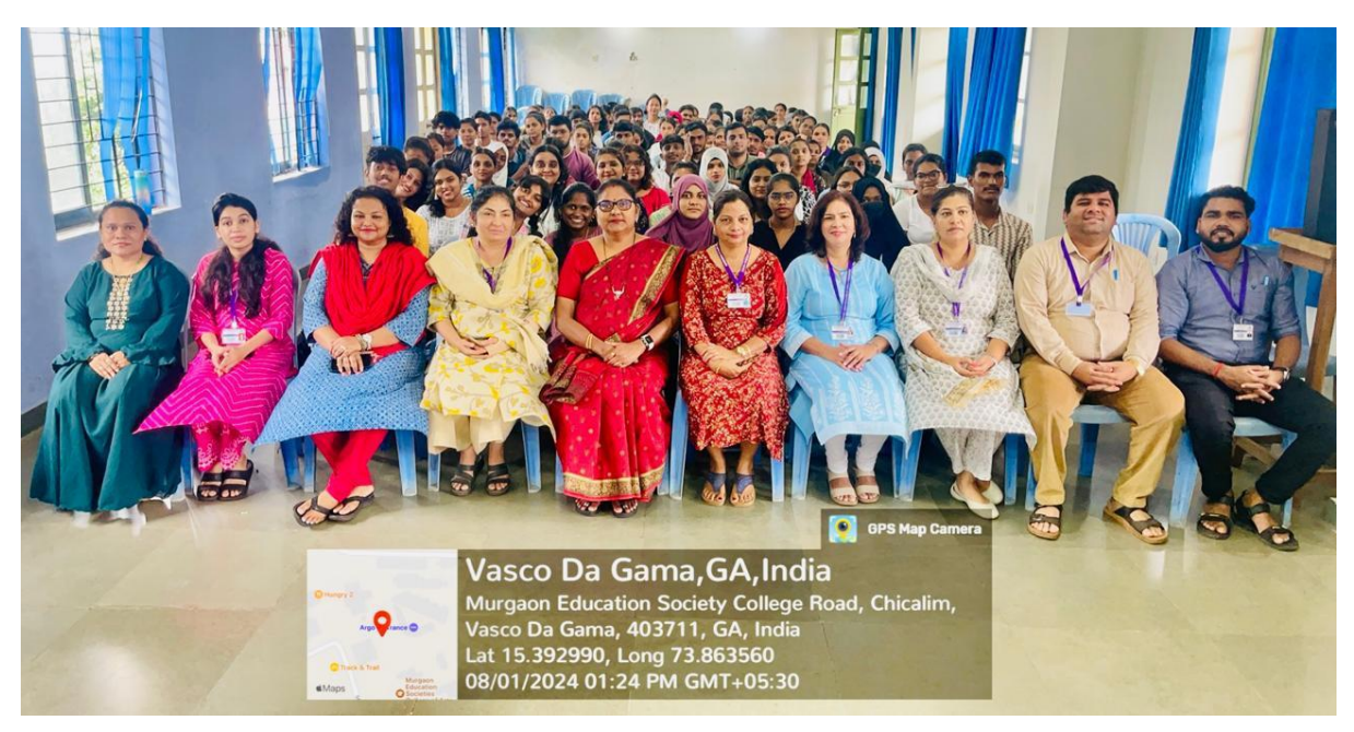
30-Hour Certificate Course on 'Basics of Data Analysis using Excel '