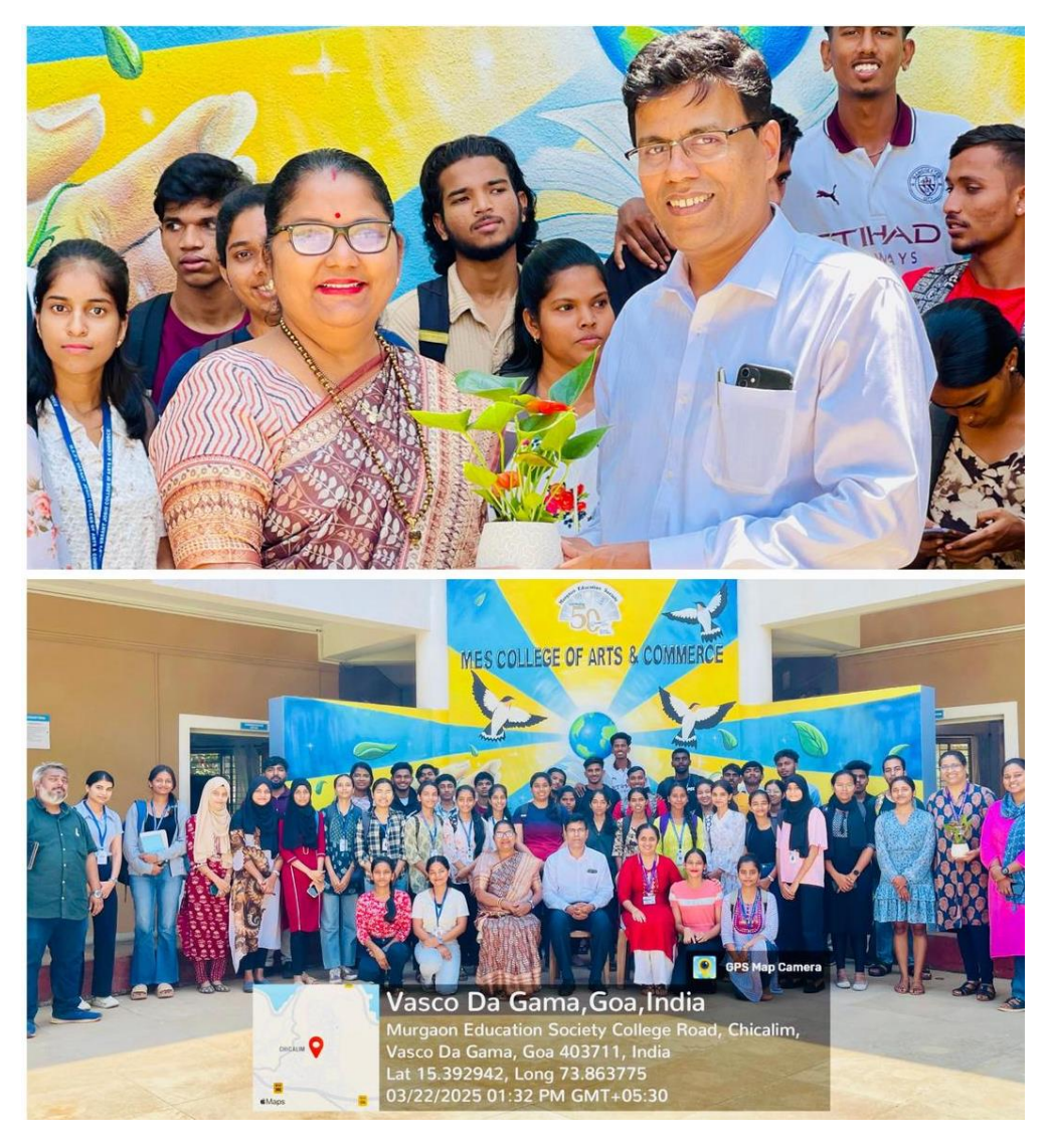
Inter-Class Competition 'ECOBUZZ 2025'