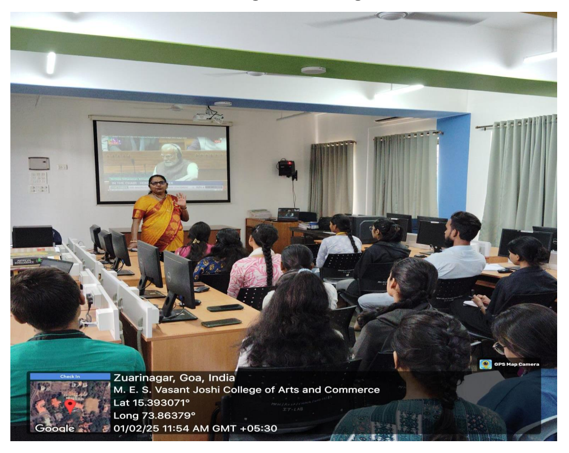
'Live streaming of Union Budget 2025'