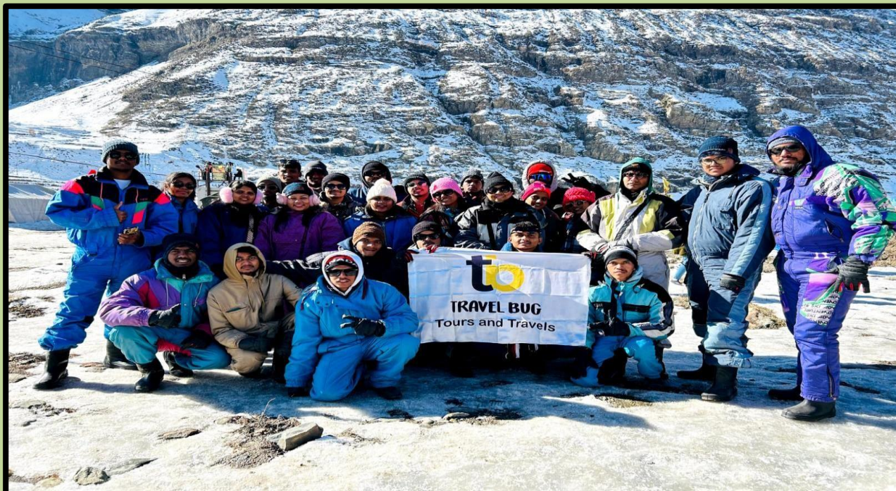
B.C.A Educational Tour to Goa-Delhi-Manali