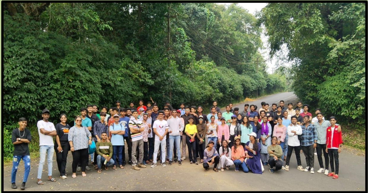
Field trip to Chandreshwar Parwat and Tanshikar spice farm under Environmental Studies