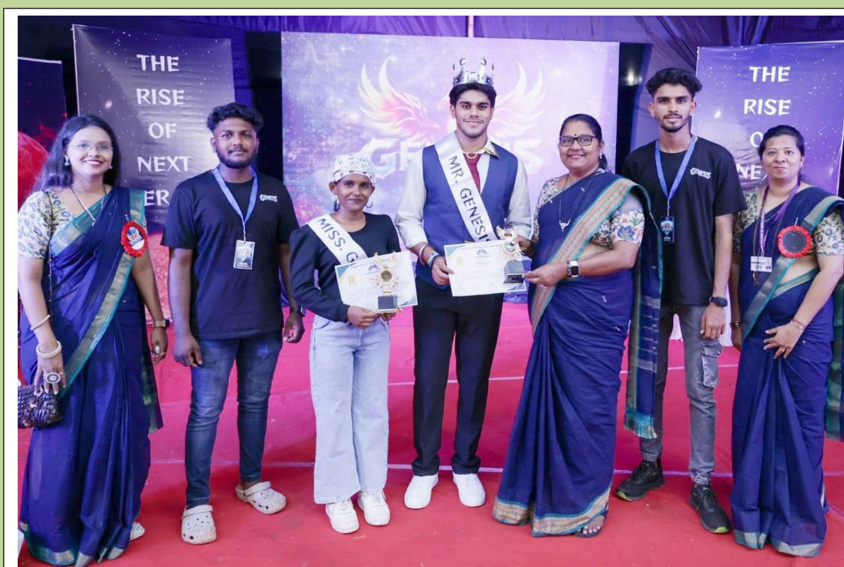
Intercollegiate department event -“GENESIS 7.0”