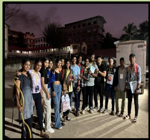
Student won various events at IT Maestro XI Event at S.E.S Sirdora Caculo College of Commerce and Management Studies in Mapusa