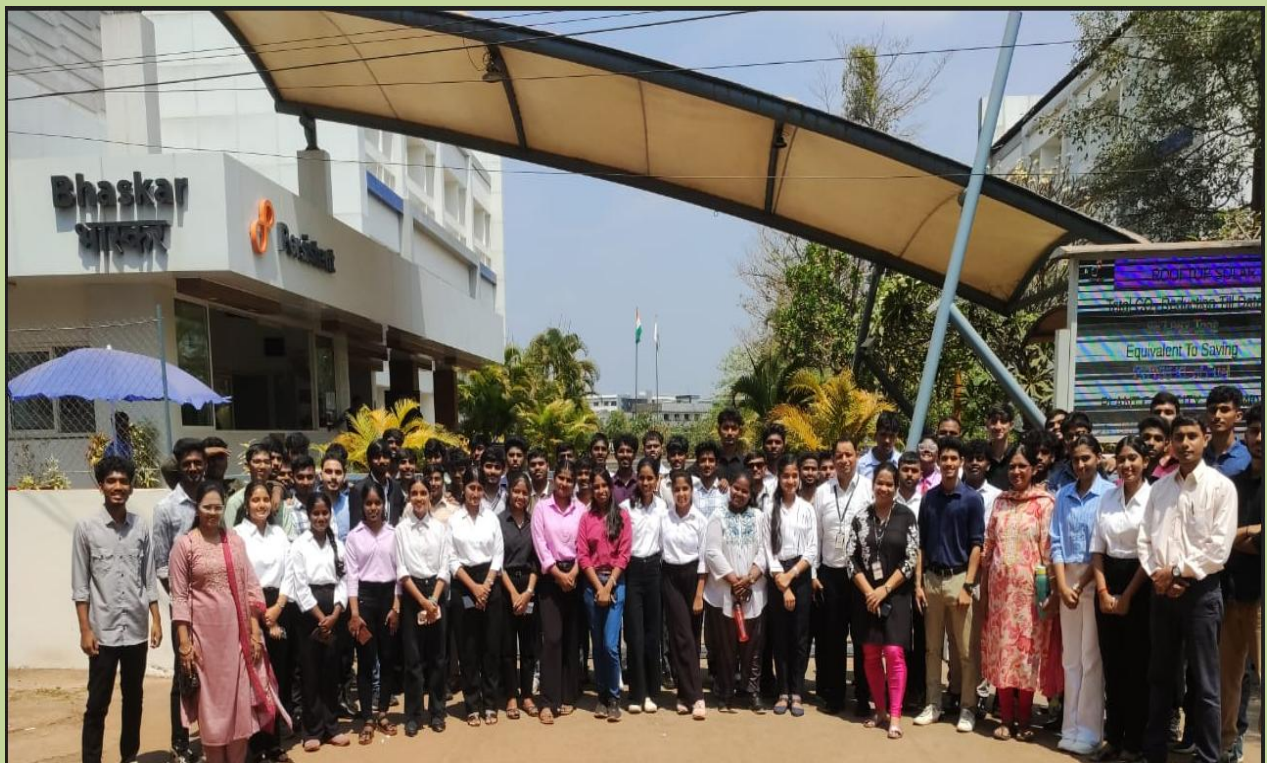
Experiential Learning Visit to Persistent Systems Private Ltd, Verna Goa