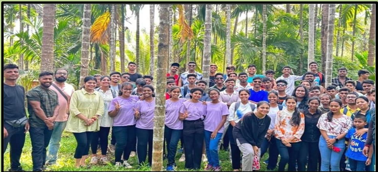
Field trip to Kumthal village under Environmental Psychology