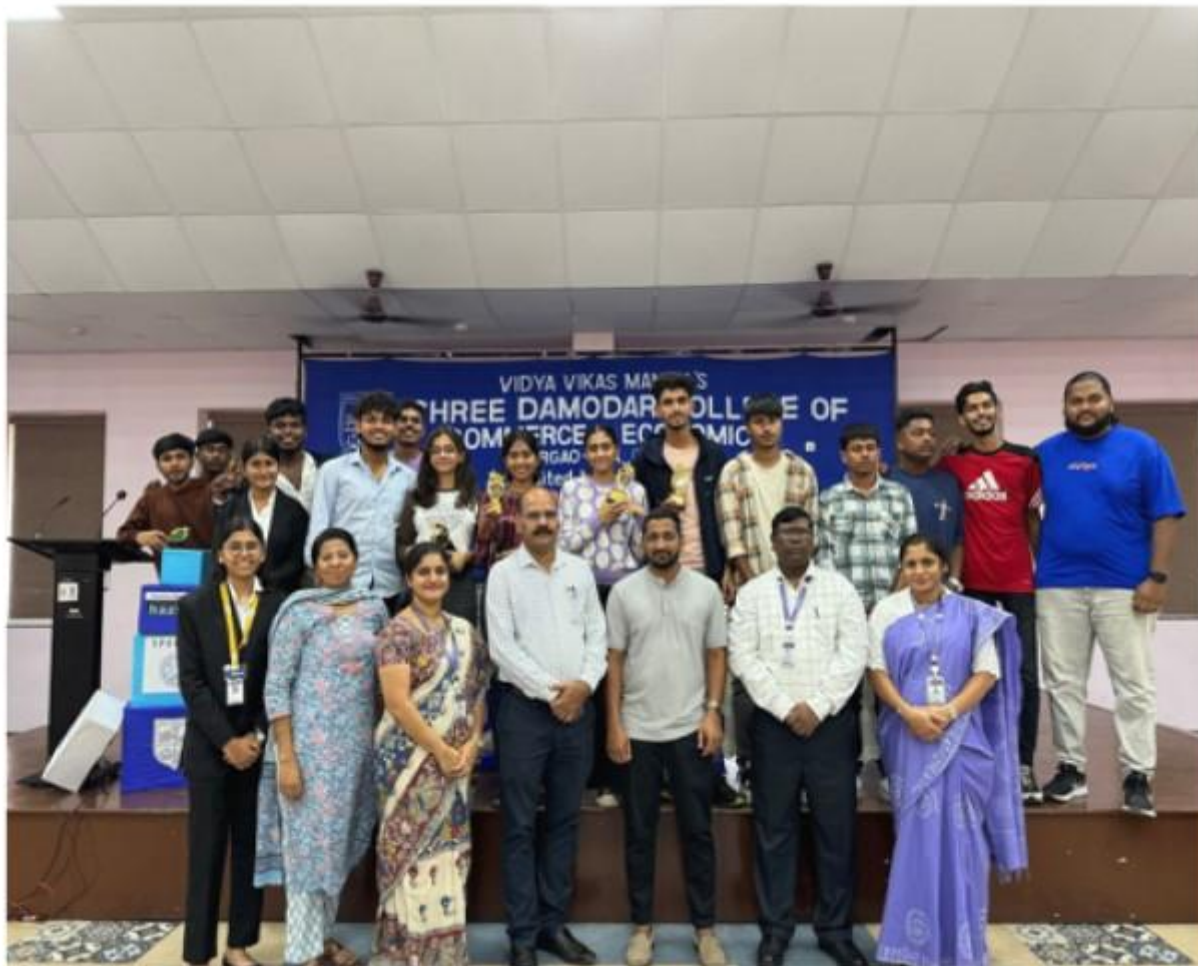
Winners of various competitions held at “Spectra” Intercollegiate event organized by at Shree Damodar College of Commerce & Economics

Note: The above fees are subject to change, as per the Notifications received from Goa University/ DHE from time to time.