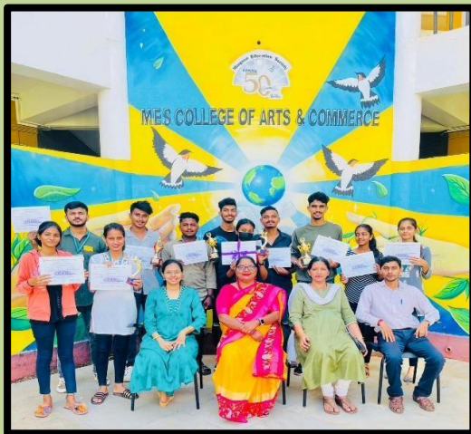
Students have won 1st place for the Event "NOESIS" under the category of Mechmania Showcase and Media Masters organized by Rosary college of Arts and Commerce.