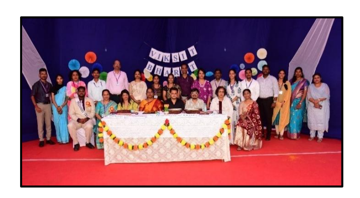
UG and PG Faculty of Commerce for Valedictory function of Commerce Fiesta 2025