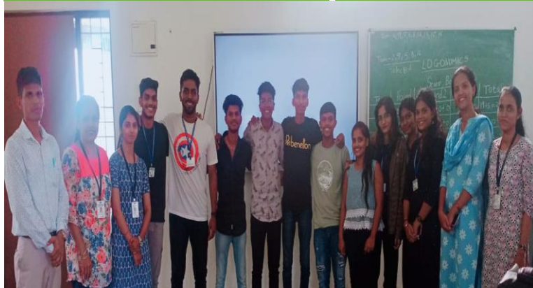
Ergonomics competition organised by Department of Commerce