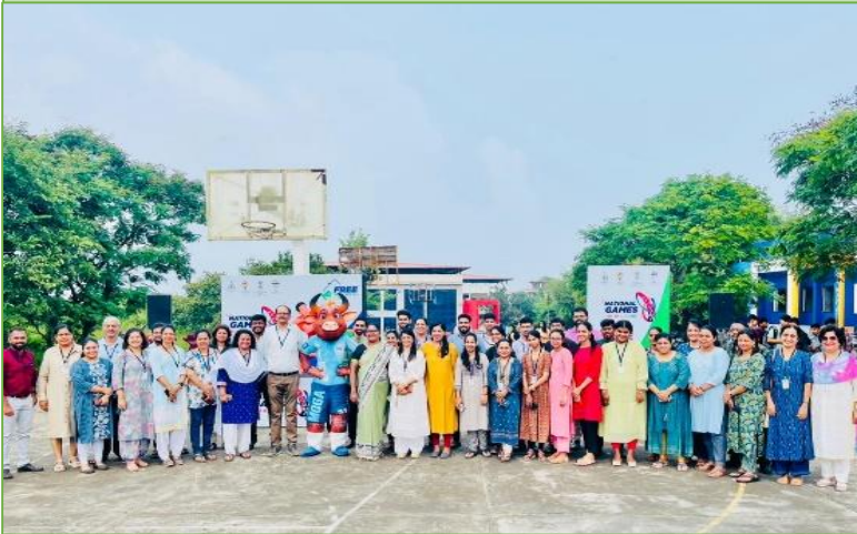
Promotion of 37th National Games at MES Campus by SAF Sports