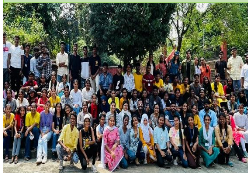
Experiential visit for First Year BCom students visit to Salaulim, Tansikar Farm