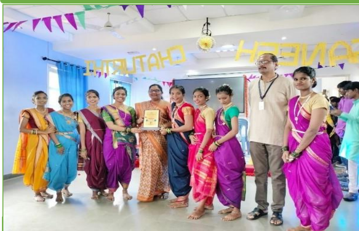
Fugdi Competition organised by the Art and Culture Association