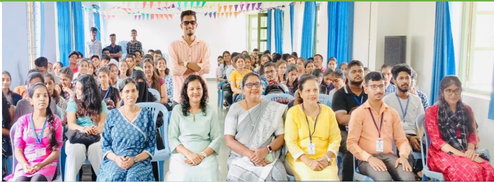
Department of Commerce organised an interactive session on 'Exploring the Legal & Regulatory Framework for E-commerce in India'.