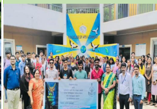
Screening of documentary on "Goa's Freedom Struggle"