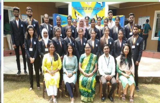
Workshop for M. Com. students on 'Workplace Excellence: Organisational Behavior and Stress Alleviation'