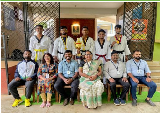
Winners of Inter Collegiate Men's Taekwondo Championship organised by Goa University