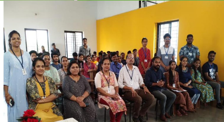
Bidding Duos competition organised by Department of Commerce under Commerce Association for SYB.Com. students