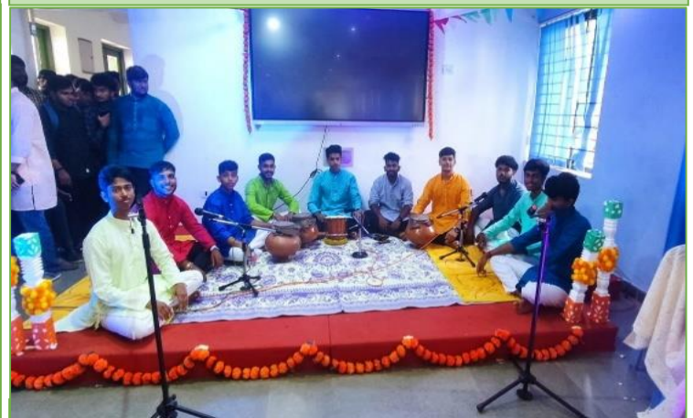
Ghumat Arti Competition organised by the Art and Culture Association