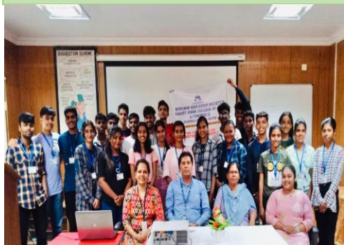
Experiential learning visit to Goa Shipyard Ltd. by commerce students