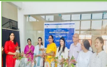
Dental camp in association with Inner Wheel Club Vasco and GMC for community