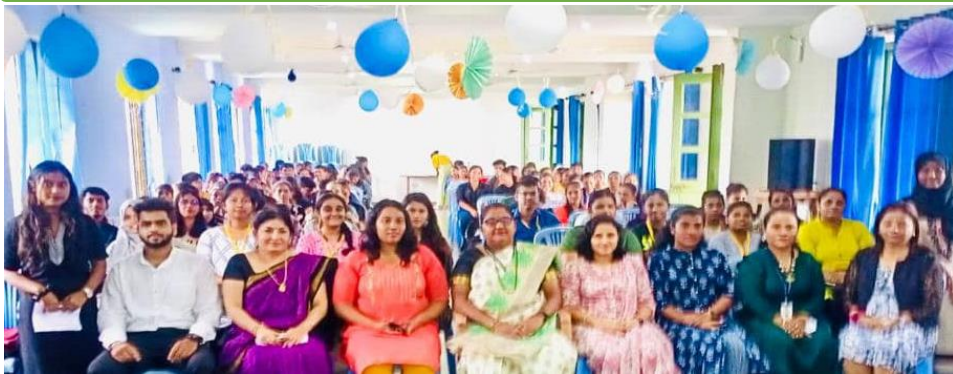
Department of Sociology organised a session on Mental Health Awareness & Tele Manas to commemorate World Suicide Prevention Day