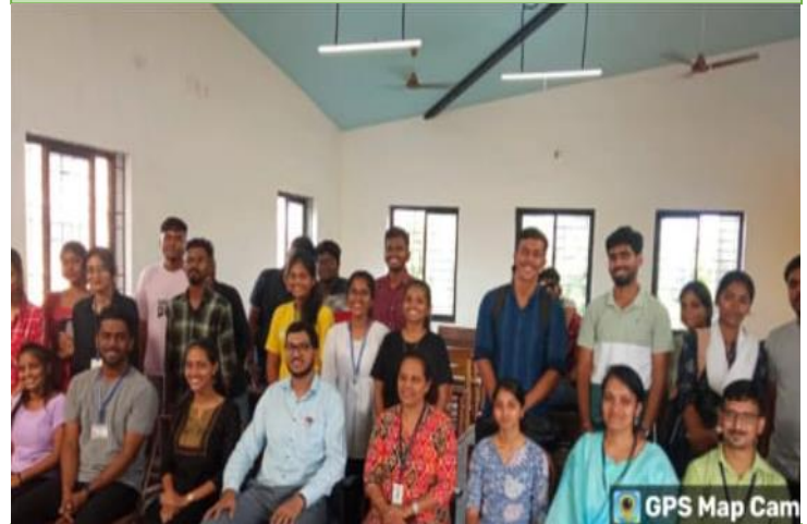
Deal or No Deal competition by Department of Commerec for TYB.Com. Students