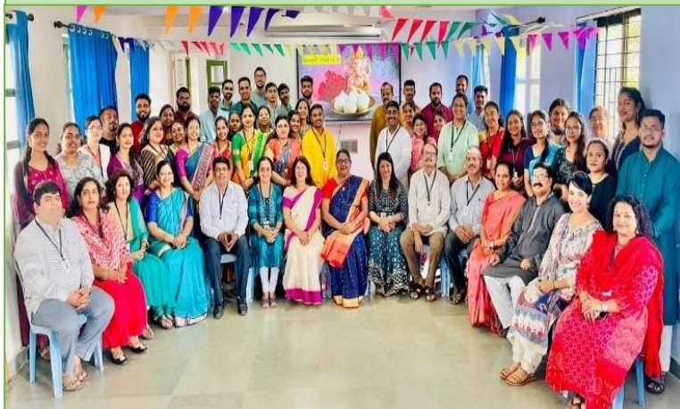
Ganesh Chaturthi Celebrations for the Teaching and Non-teaching Staff