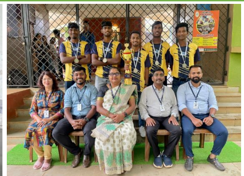
Runner's up at Inter collegiate Men's Cross Country Championship organised by Goa University