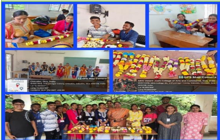
Garland Making Competition organised by the Women's Cell 'Jyoti'