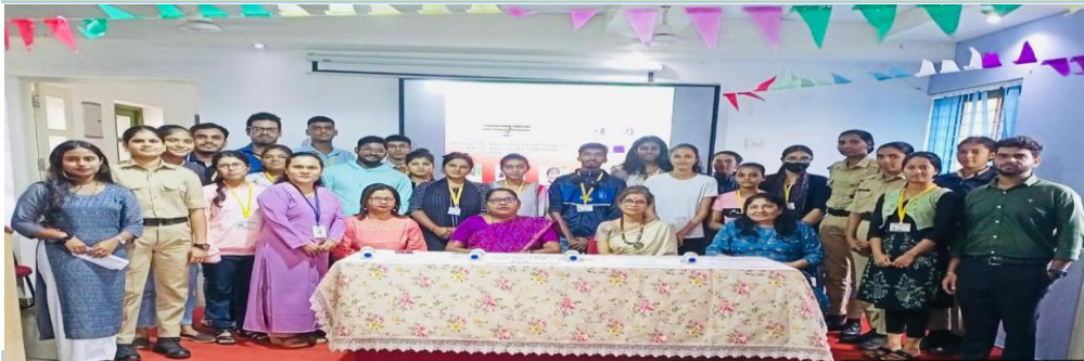
Department of Sociology in association with Dnyanvardhini Divyang Training College Vasco organised a session on 'Navigating the path from stress to social wellbeing through social skills'