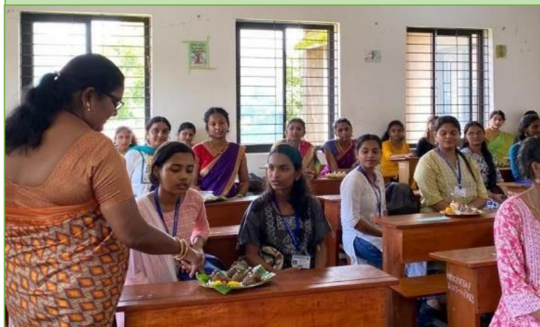
Chavat Dish Making Competition using Millets organised by the Art and Culture Association