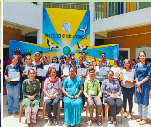
TYB.Com. students were winners of the Resume Writing Competition