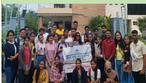
Annual Study Tour organized Cochin, Munnar, and Wonderland organized by Dept of Commerce