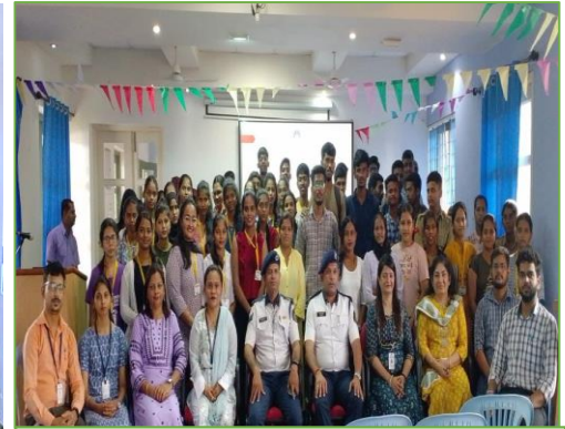
Workshop on 'Road Safety Awareness for Youth' organised by Consumer Awareness Cell in association with IQAC and Department of Sociology