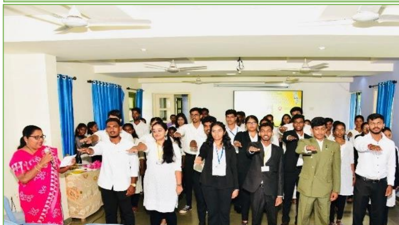
Oath Taking Ceremony during the College Council Inaugural