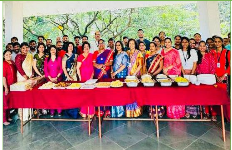
Diwali Celebration by staff