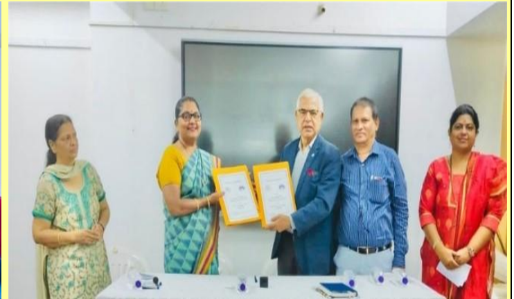
MOU between GMA and MES's Vasant Joshi College of Arts & Commerce