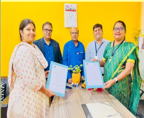
MOU between Lions club of Cortalim and M.E.S. Vasant Joshi College of Arts & Commerce