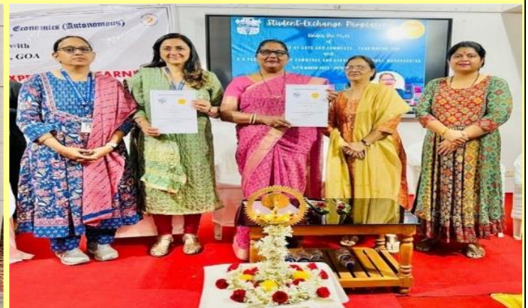
MOU between Podar College, Mumbai and M.E.S. Vasant Joshi College of Arts & Commerce