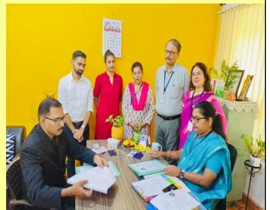
MOU between Mindcraft and M.E.S. Vasant Joshi College of Arts & Commerce