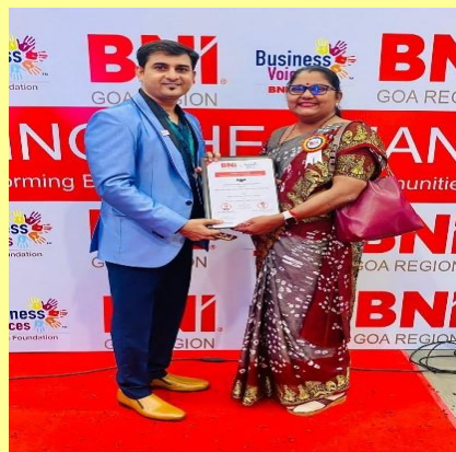
MOU with Business Network International