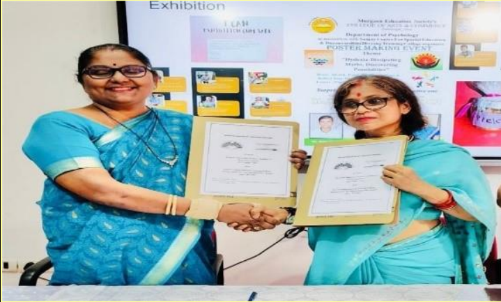
MOU between Dyanvardhini Divang Training College of B.Ed. for Special Education and M.E.S. Vasant Joshi College of Arts & Commerce