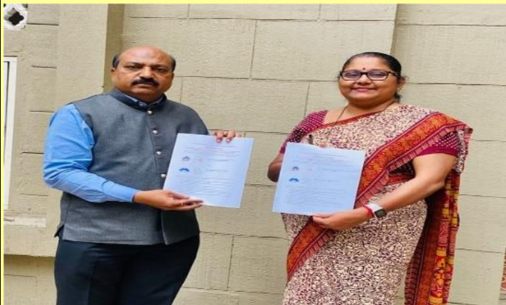
MOU between Poona College of Arts, Commerce & Science and MES's Vasant Joshi College of Arts & Commerce