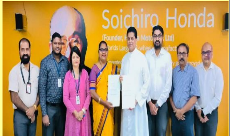
MOU between FIIRE and M.E.S. Vasant Joshi College of Arts & Commerce