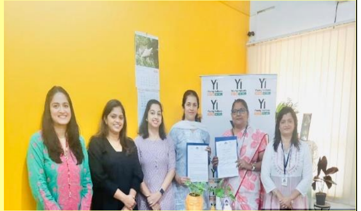
MOU between CII-YI and MES's Vasant Joshi College of Arts & Commerce