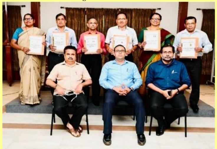
MOU between GIPARD and M.E.S. Vasant Joshi College of Arts & Commerce