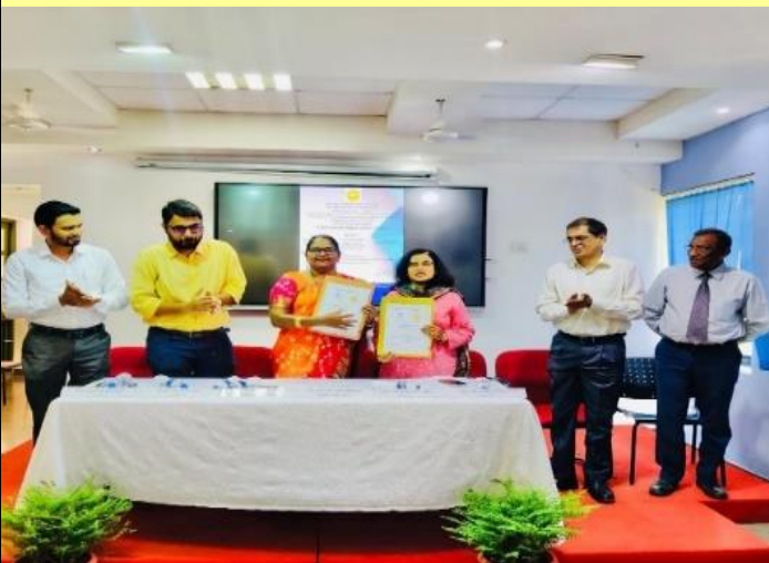
MOU between GCCI and M.E.S. Vasant Joshi College of Arts & Commerce