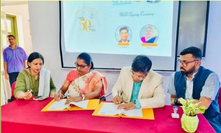
MOU between GTA and MES's Vasant Joshi College of Arts & Commerce