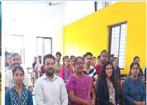
Mega Placement Drive in association with CII- Model Career Centre