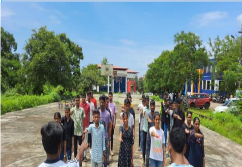
National Sports day celebration