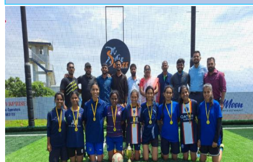
Inter Department Football for Women Winners - B.COM Department