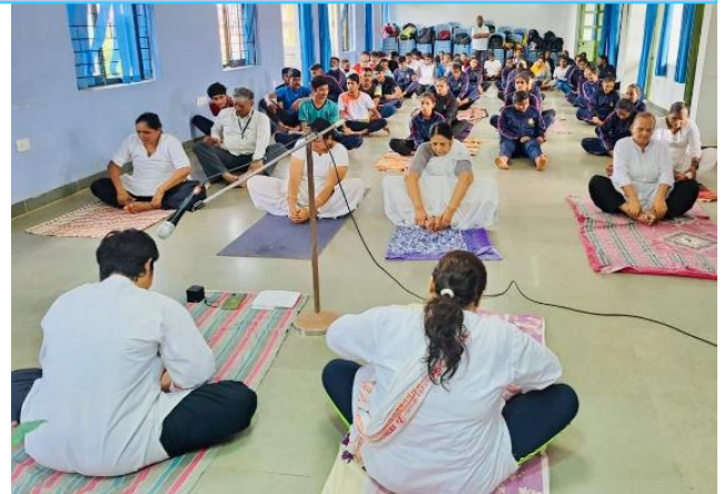
International Yoga Day Celebration organised by Department of Physical Education and Sports, N.C.C. Wings, N.S.S. Unit and Health Centre