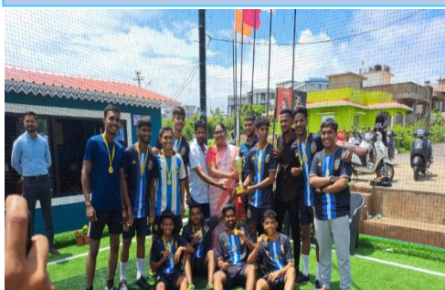
Inter class Football for Men Winners - SYBCOM D Runner's up – TYBA