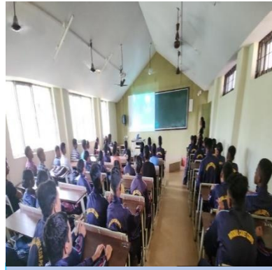
Movie screening and awareness on anti- ragging activities