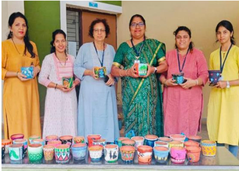
Pot painting competition - Green initiative Nature club and Resource Management cell - Offered as mementos to Resource persons for College functions.