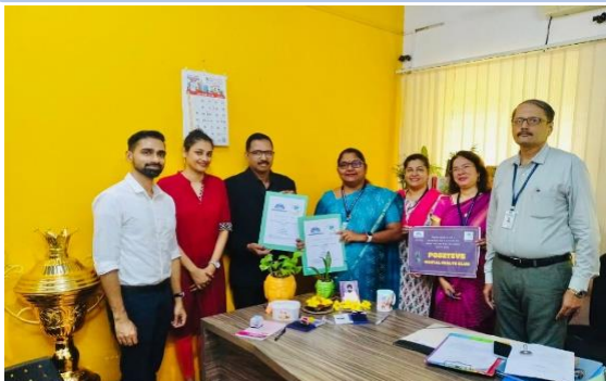
Launching of Positive Mental Health Club