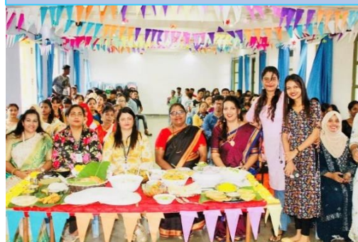
Festival of India - Travel and Tourism department, Tourism Club and IQAC Cell