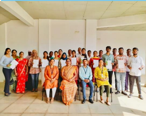
PTA meeting along with marksheet distribution for M.Com students