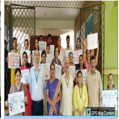
Slogan writing competition for teaching and non-teaching staff organised by Anti- Ragging Committee