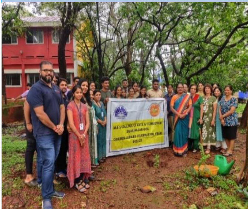
Vanamhotsava Tree Plantation - in collaboration with YUVA organisation and Mamlatdar office Vasco