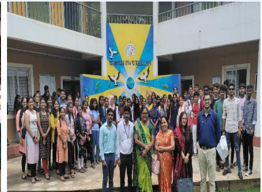
Screening of Documentary on Goa's Freedom Struggle titled 'Goem Swatantryachem Homkhon' organised - Dept. of Konkani