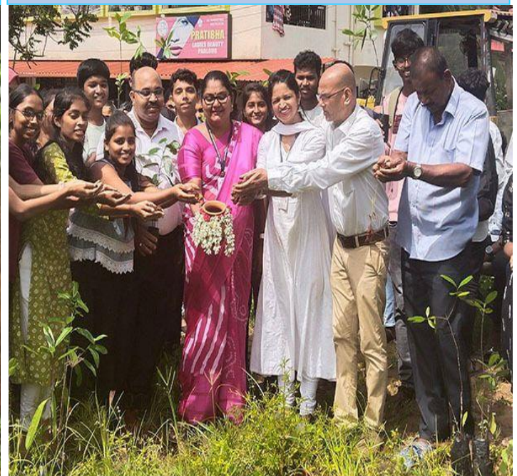
'Meri Matti Mera Desh' distribution of plant samplings to the Staff and Sancoale Panchayat members