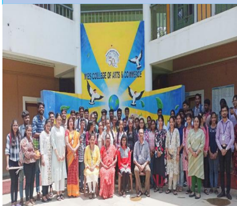
Orientation on Time Management - for TY B.Com Semester V Students by Counsellors of the College