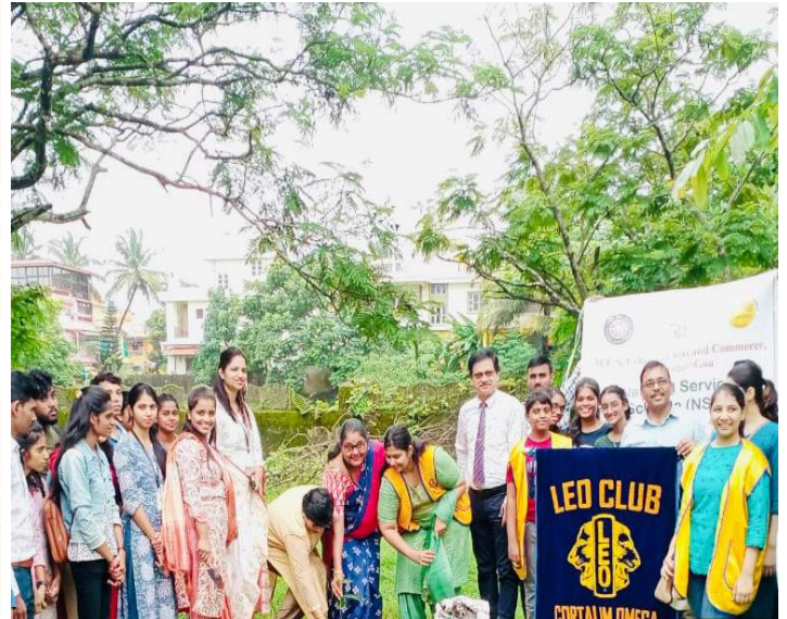
Tree Plantation Drive in collaboration with Lions Club, Cortalim