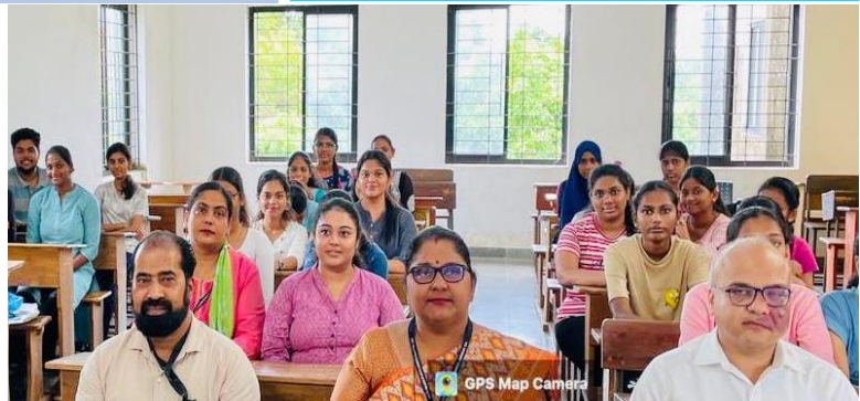
IQAC and Entrepreneurship Hub in Collaboration with Forum for Innovation, Incubation, Research and Entrepreneurship (FiIRE) organized a session on 'Nurturing Business Ideas to Real Entrepreneurial Opportunities'