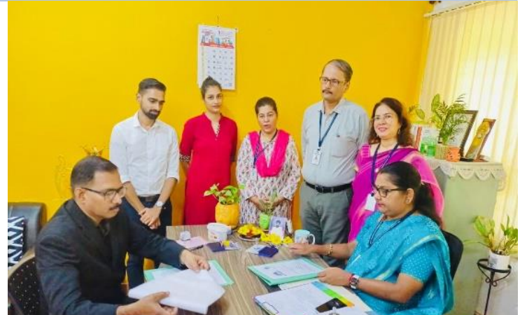
MOU with Mindcraft- Psychology Department