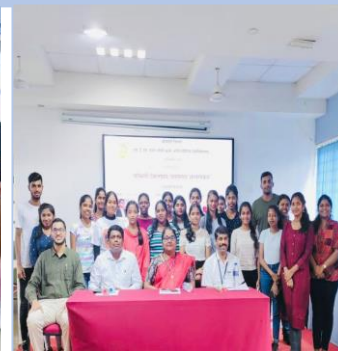
Inauguration of 30 hrs Certificate course in KONKANI TYPING for Skill development by Department of Konkani