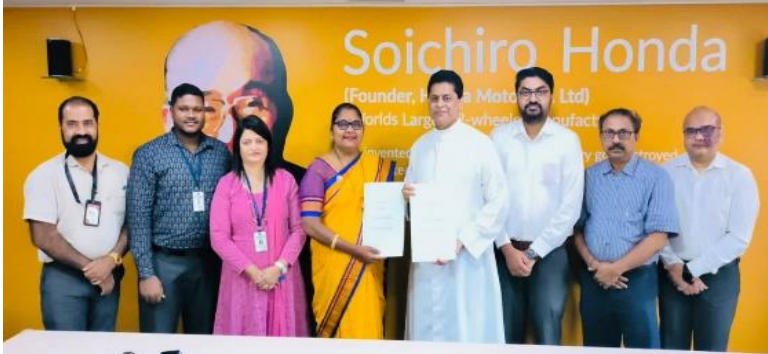
MOU with Forum for Innovation Incubation Research and Entrepreneurship (FiiRE)