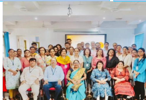
Guru Purnima Day Celebration organised by IQAC in association with Value Education Cell