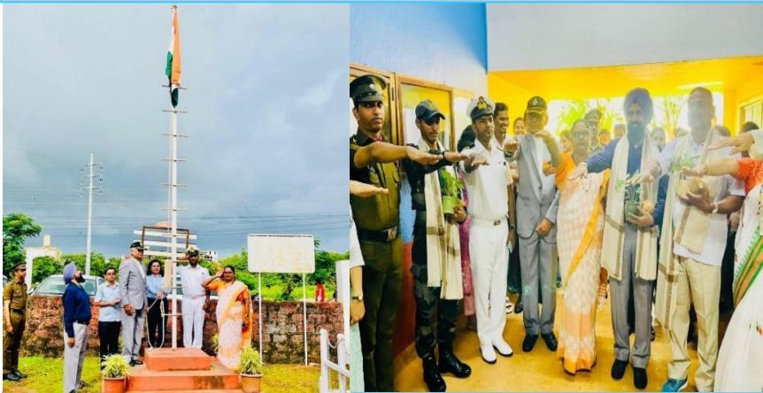
Independence Day Celebrations- Flag-hoisting, taking pledge and felicitation of Veers