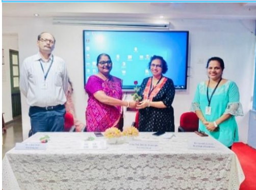
NEP Orientation for Students of B. Com. Semester I