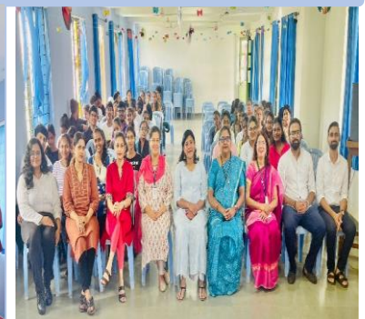
30 hrs Certificate course in Counselling techniques