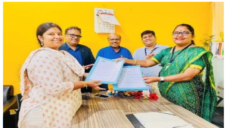
MOU with Lions Club of Cortalim for extension and outreach programmes