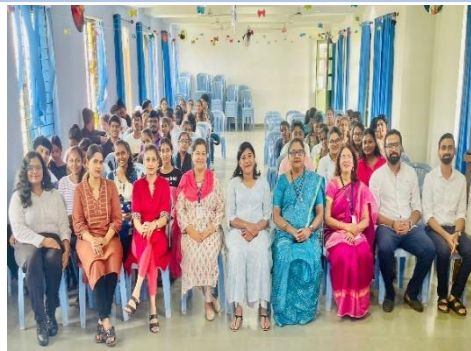
Induction of Psychometric Club by Department of Psychology