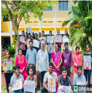
Poster Competition on Anti-Ragging organised by the Anti-Ragging Cell