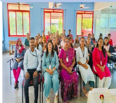
Inauguration of Certificate course in N.E.T. /S.E.T. preparation organised by M.COM Faculties