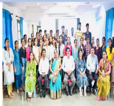
Inauguration of 30 hrs Certificate Course in Library and Information Resources organised by IQAC in association with MES Alumni Association