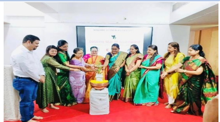
Launching ceremony : Cooking Star of Goa Award by Rebuild India Association.