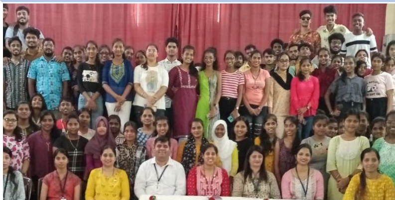
Blood Donation Camp by Rotary club