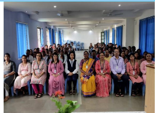
Cost and Management Accounting Orientation for students of B.Com Semester V & M.Com Part I and Part II