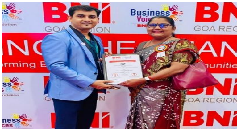
MOU with Business Network International (BMI)