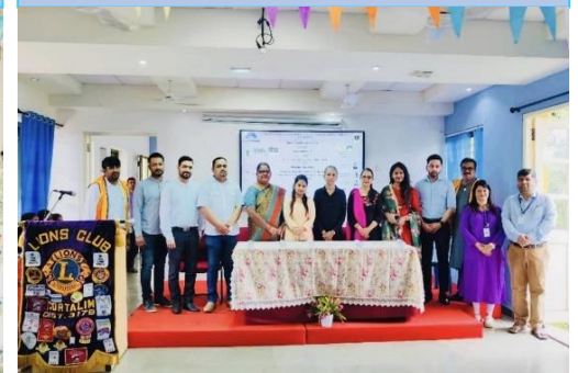
Super speciality Medical Camp by IQAC in association with VIDA Medical Clinic and Lions Club of Cortalim