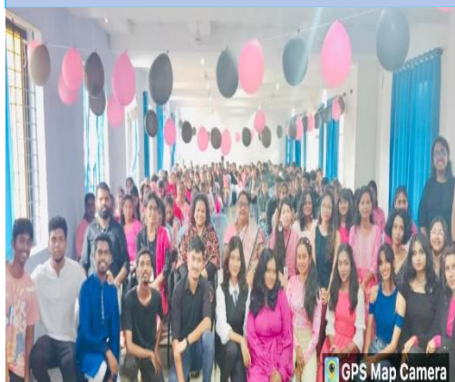
Orientation and Inauguration of LITSWAG Association by Department of English for students