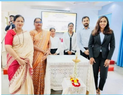
Inaugural Ceremony for Students of B. C. A. Semester I