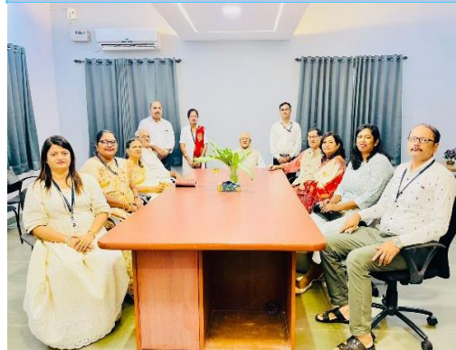
Inauguration of IQAC Room, Board Room, pantry room and store room