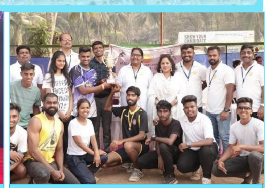
44<sup>th</sup> Annual Athletic Meet held at Chicalim Panchayat ground