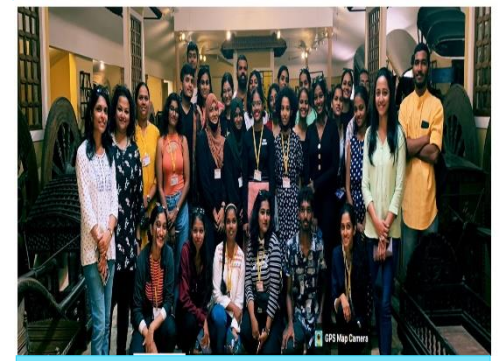
The Department of English visited Goa Chitra Museum, Houses of Goa museum, Penha de Franca and Sunaparanta, the Centre for Art, Goa, as part of experiential learning