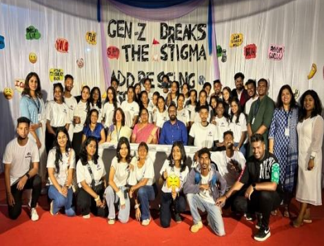
'Psychozest 2023' organised by Department of Psychology