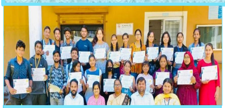
Certificate course in Verbal Reasoning organised by Mathematics Department