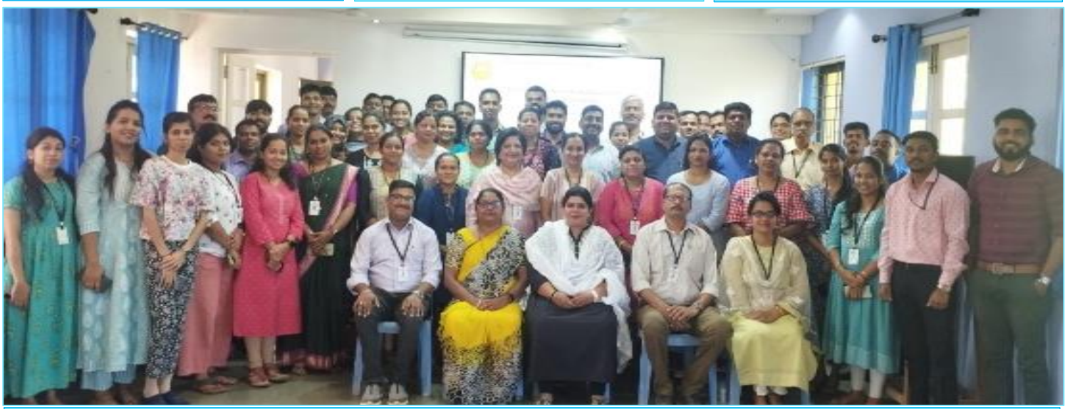
'Talk on Rights, Schemes and Inclusiveness for Persons with Disability'