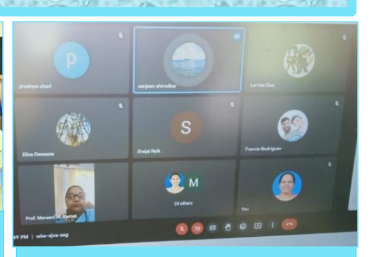
A Webinar on Stock Market Trading & Investment Avenues, in collaboration with IQAC for Faculties & B.Com. Students