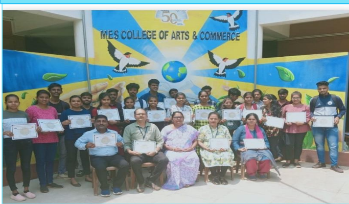
Income Tax Returns Filing Certificate Course Organised by Department of Commerce

Short term certificate course in Library and Information Resources for skill development organised by T.B. Cunha Information Centre in association with MES College Alumni Association & Library Advisory Committee