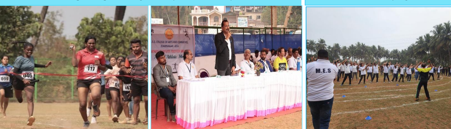
44<sup>th</sup> Annual Athletic Meet held at Chicalim Panchayat ground