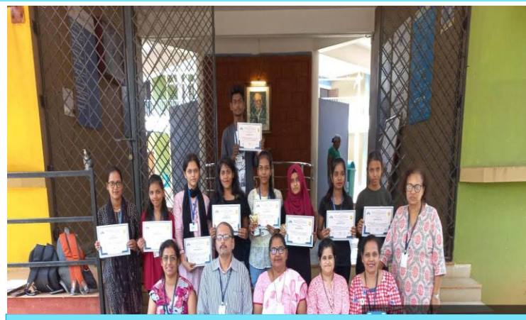
Poetry writing Competition on 'Moral Values' organised by Value Education Cell