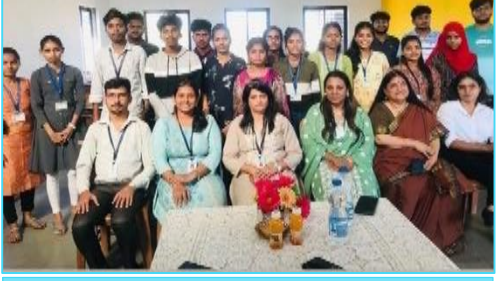
Entrepreneurship Hub organises session on "Information on schemes for Entrepreneurs and one to one mentoring"