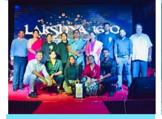
Lakshya 16.0 Organised by Department of Business Administration