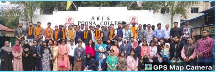
International conference at POONA College, Pune, in collaboration with M.E.S. Vasant Joshi College of Arts & Commerce, Zuarinagar Goa under MOU