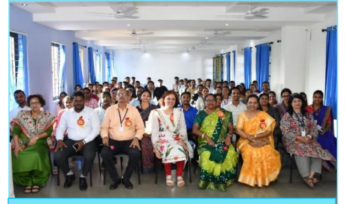
State Level Seminar organised by Dept. of Commerce on Entrepreneurship and Taxation Laws Recent Trends, Issues and Challenges, Sponsored by DHE, Govt. of Goa, in Association with Fiire, Goa