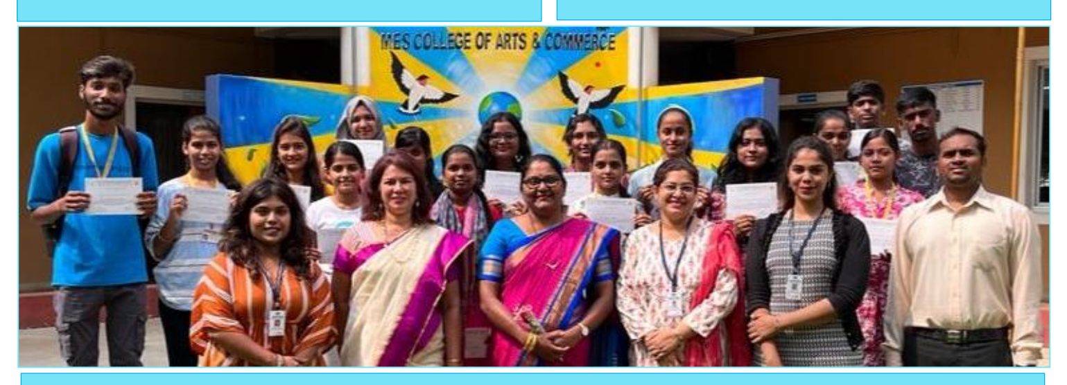
Certificate course in Counselling Techniques organised by Counselling Cell