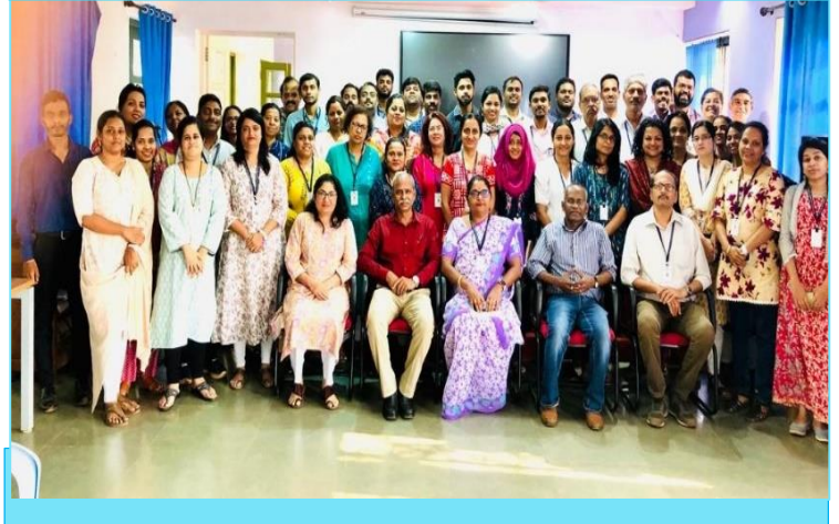
Workshop to Seek Inputs from Faculty Members for GSRF -