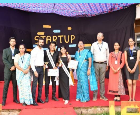
'Commerce Fiesta' – Intra-class competition organised by the Department of Commerce