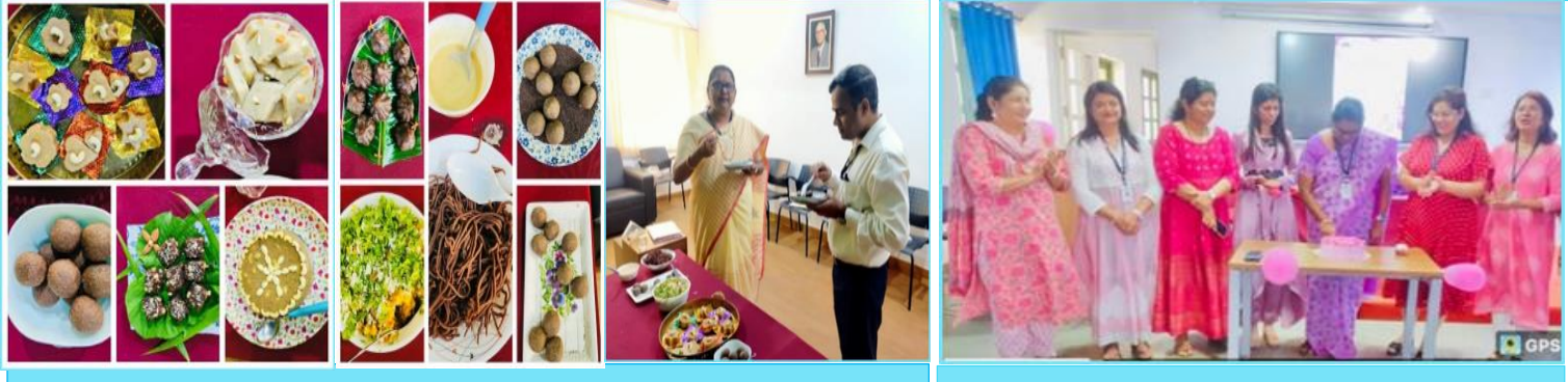
'Eat healthy Millets' competition organised by Canteen Committee