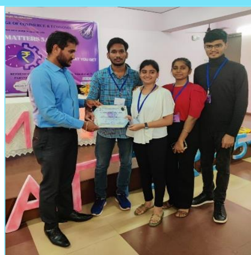
Our students won in 'Money Matters', 5.0 intercollegiate event organized by Damodar College