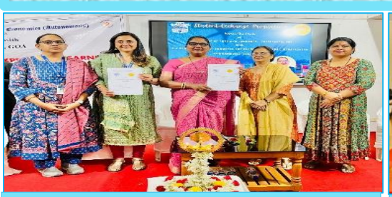
MOU between M.E.S. College & R.A. Podar College