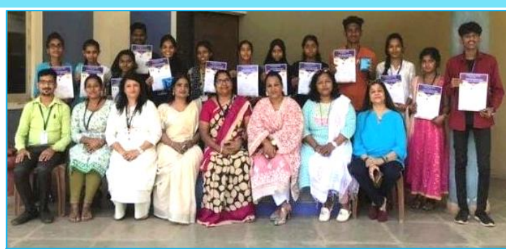
Certificate Course "Youth Entrepreneurship Programme for Skill Development" in collaboration with Alumni Association & WEBN by GOWOMANIA – Organised by Entrepreneurship Hub