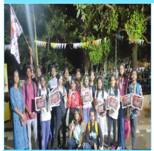
DSC English Students of our College have won prizes at PEGASUS 2023 organised by Parvatibai Chowgule College, Margao