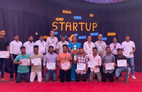
Our Men's Team emerged Winners of Inter Collegiate Men's Kabaddi Championship 2023 organised by Goa University