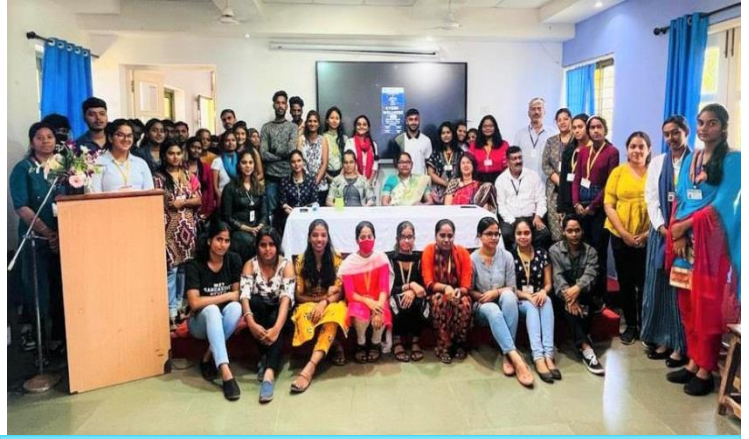
Session on 'Cyber Wellness' organised by Counselling Cell in collaboration with NDLI Club & IQAC