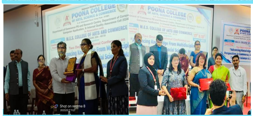
International Conference at Poona College in collaboration with MES's Vasant Joshi College of Arts & Commerce, Zuarinagar Goa