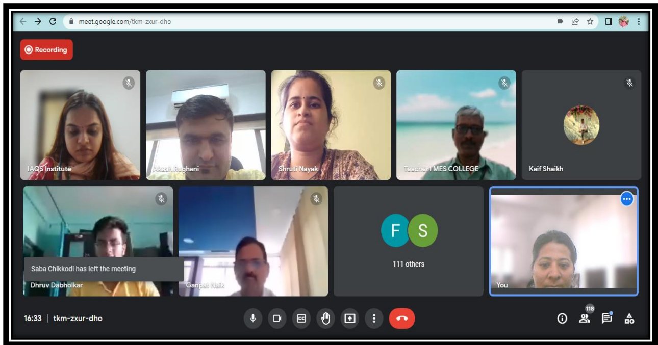
Participants of the session