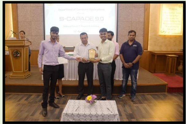
TYBCA students won 2 nd place in Project Exhibition organized by Rosary College of Commerce & Arts