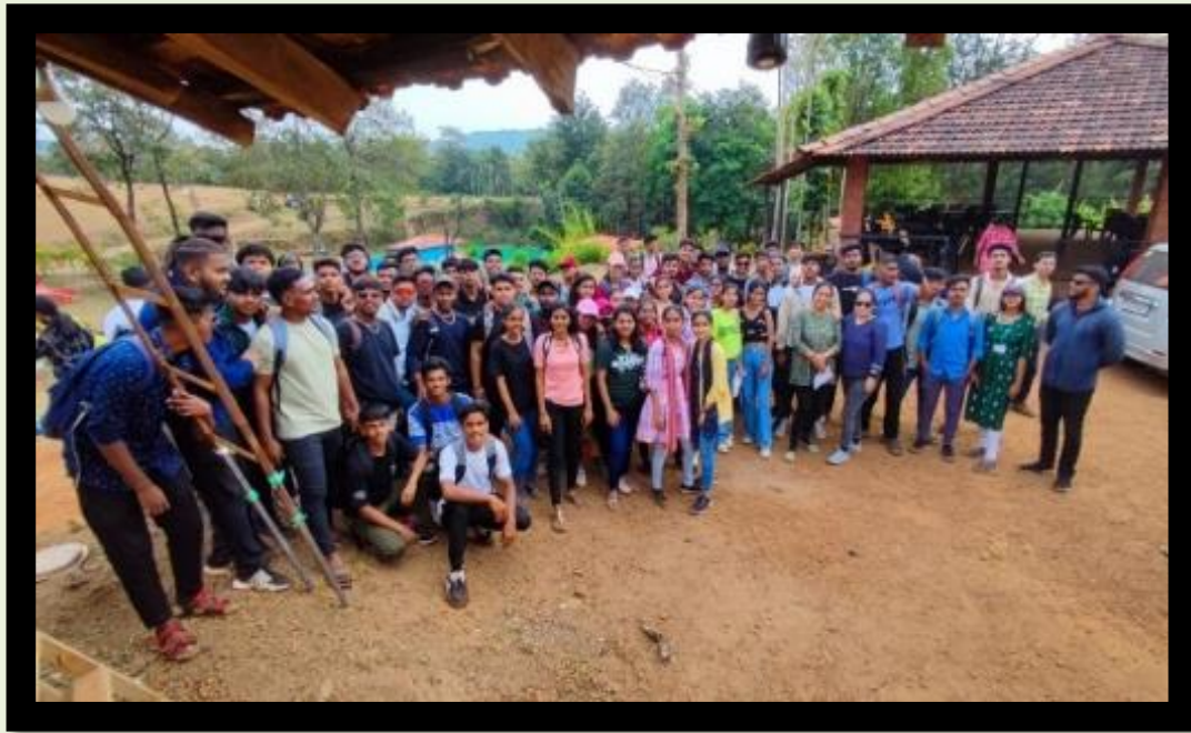
Field Trip to Dr. Malik Farm Pernem-Goa under Environmental Studies