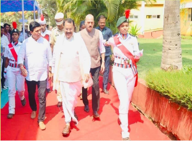
Guard of Honour given to Honourable Governor and Vice-Chancellor Shri. P. S. Sreedharan Pillai