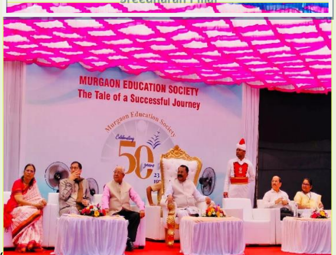
Murgaon Education Society – Tale of a successful journey, Book release Ceremony.