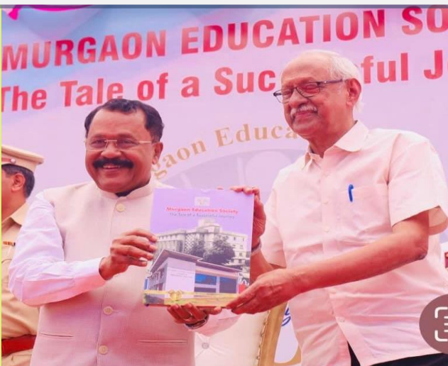
Book release Ceremony at the hands of Honourable Governor and Vice-Chancellor Shri. P. S. Sreedharan Pillai and Jnanpith awardee, Shri. Damodar Mauzo