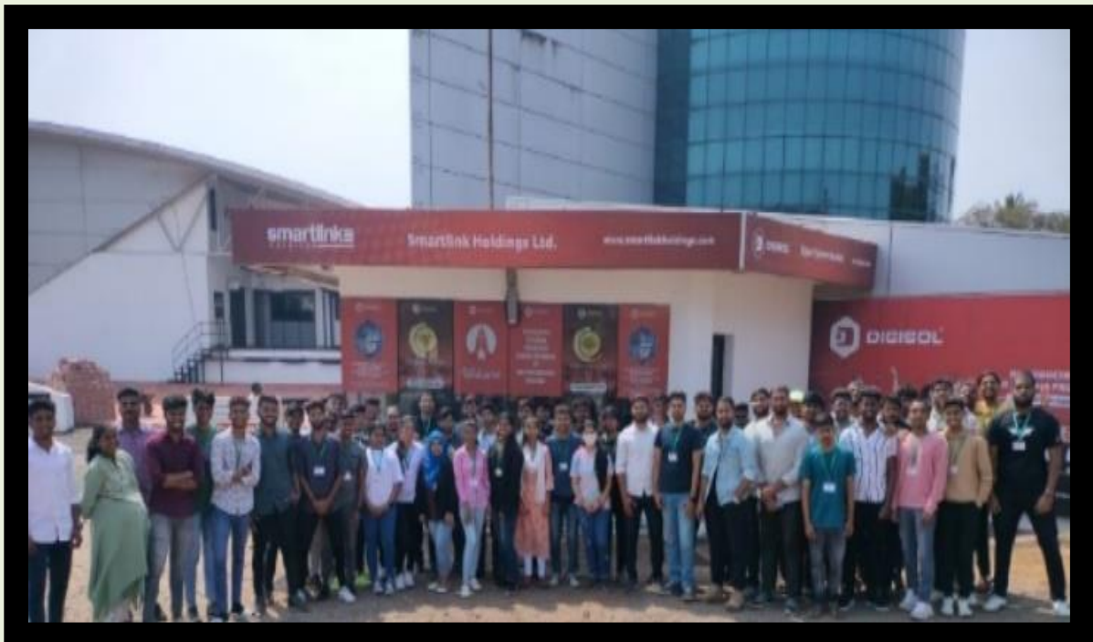
Field Trip to Smartlink Holdings Pvt. Ltd Field Trip