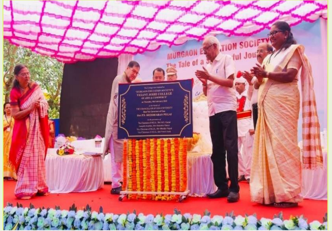
Renaming of College to MES's Vasant Joshi College of Arts & Commerce.