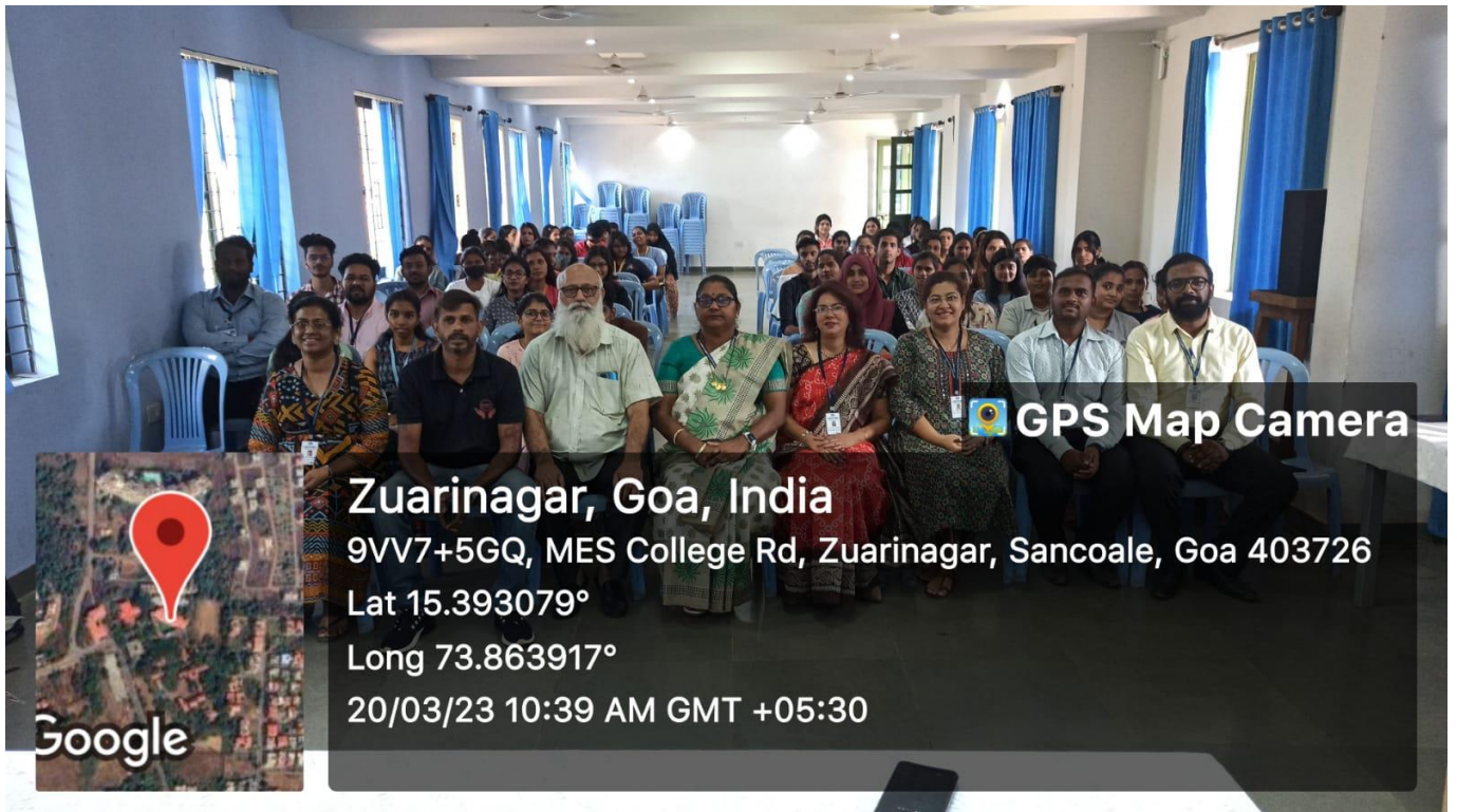
The resource persons from Kripa Foundation, Anjuna alongwith the faculty and participants of the workshop.