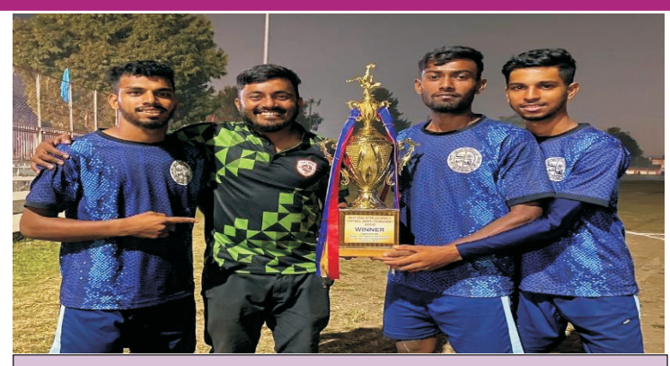
Goa University Men's Football Team won the West Zone Inter University Men's Football Championship