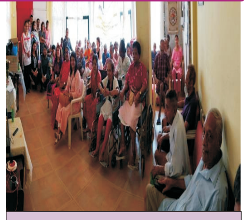
Joy of giving extension activity at old age home, Bogmalo