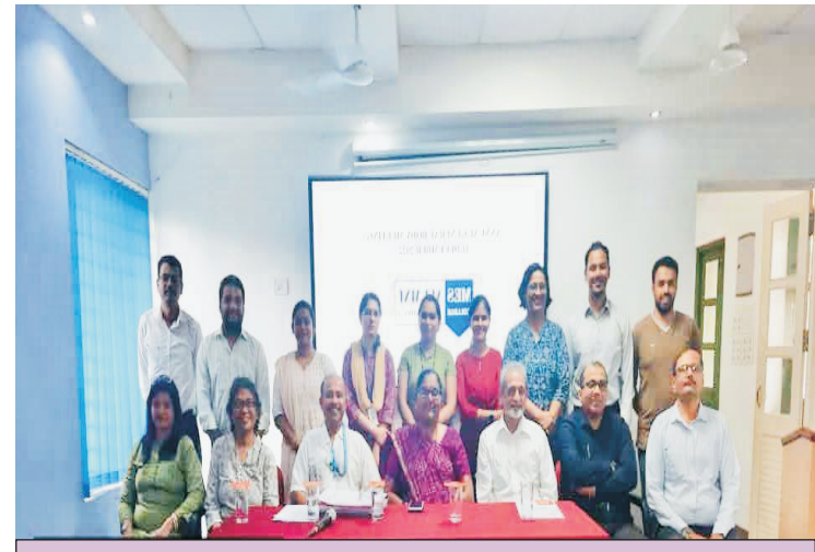
Congratulations to the new committee of Alumni Association of MES