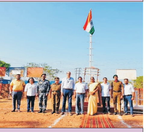
19<sup>th</sup> December- Liberation Day Celebration