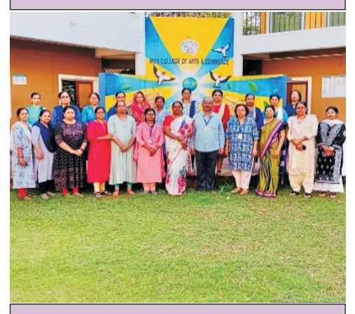
Women Empowerment program for housewives by IT department