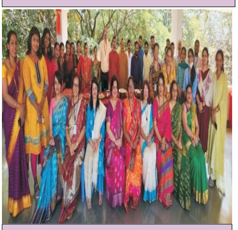
Diwali celebrations by staff of MES College