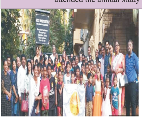
Children's Day Celebration by the Staff of MES College of Arts & Commerce, Zuarinagar at Asha Sadan Social Centre Sasmolem, Baina, Vasco-Goa