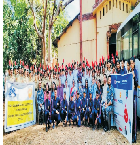
Blood Donation camp as part of Golden Jubilee extension activity by NCC unit