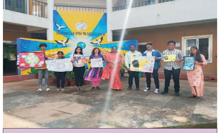
Students participated in Poster competition to celebrate International Disability Day