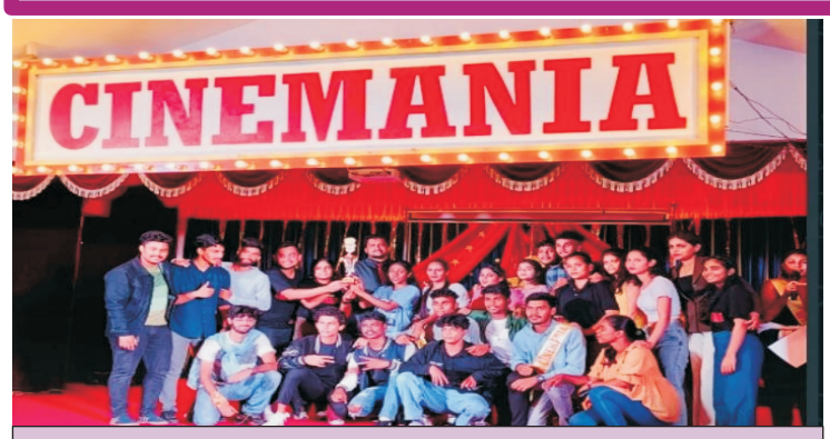
MES Students were the Runners up at the Don Bosco College event- Cinemania