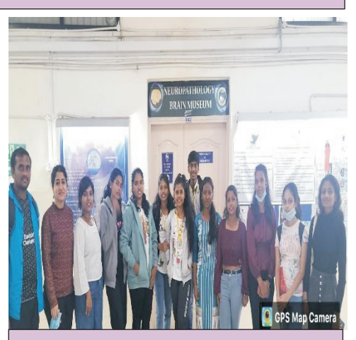
Students of Psychology Dept visited Brain Museum in Bangalore