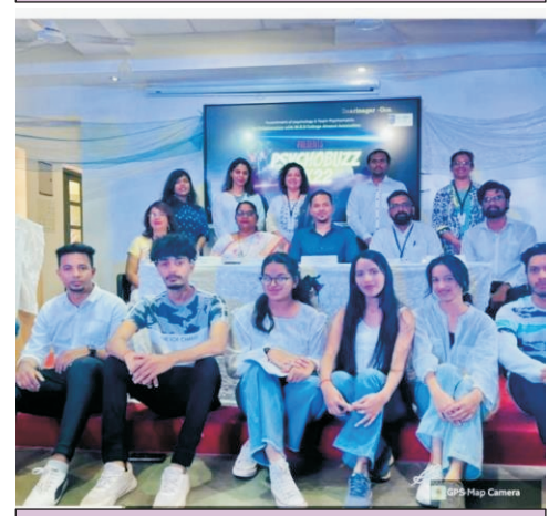
Psychobuzz – cultural event of the Department of Psychology