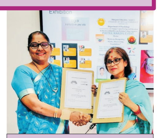
Signing of MOU between MES College and Dyanvardhini Divang Training College of B. Ed. for Special Education