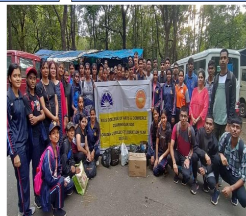
On the Occasion of World Tourism Day, Cadets attended Trekking as well as Cleanliness Camp on 27th September 2022 at Tambdi Surla