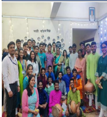
College organised Saraswati Pooja celebration in the library premises