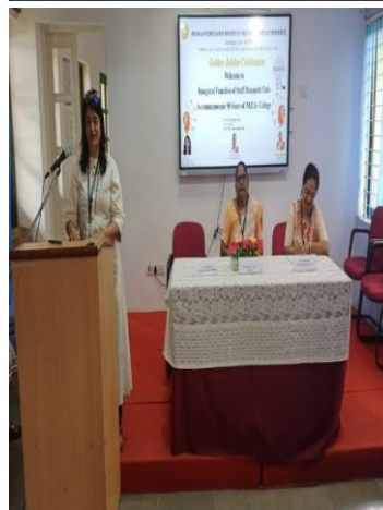
Inaugural Function of Staff Research Club