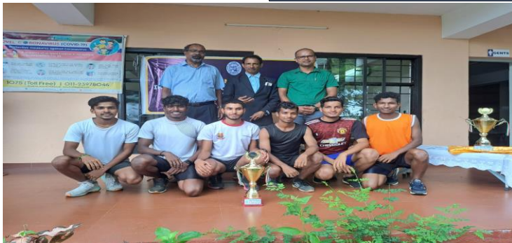
The Men's Team of MES College emerged Runner's up in the Men's Cross Country Championship 2022 organised by Goa University