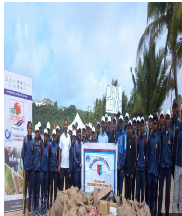
NCC cadets participated in a Cleanliness Drive at Bogmalo Beach