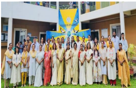
Teachers wore the traditional colours of gold, white and off white for Onam Celebration at MES College