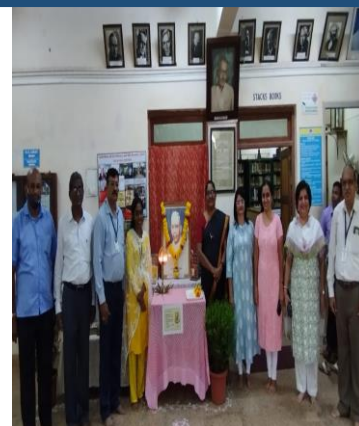
The Library Committee commemorated 64 th Death Anniversary of Dr. T.B. Cunha