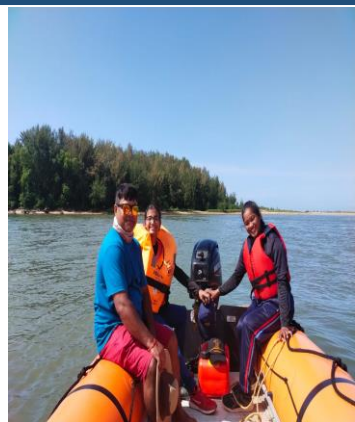
The NCC cadets participated in an Ocean Sailing Camp at Karwar