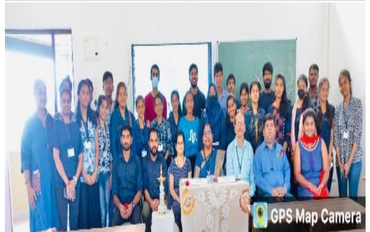
Certificate Course in Logical Thinking by the Department of Mathematics and Statistics