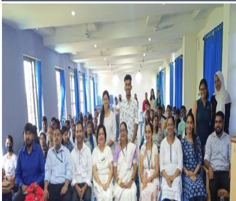
The Department of Economics organised a session on ‘Economists in the Making’