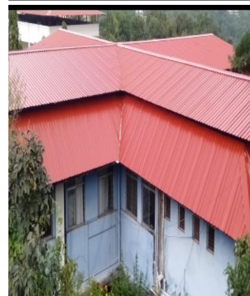
The reconstructed structure of the BCA and Library building