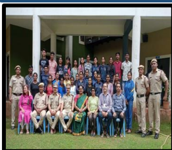
NCC Cadets participated in Disaster Management Training at Goa Institute of Public Administration and Rural development- GIPARD