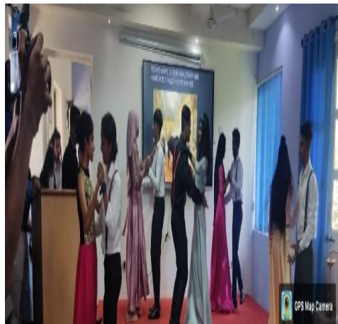
A scene of Romeo & Juliet performed by our students of the English Association – 'Litswag'