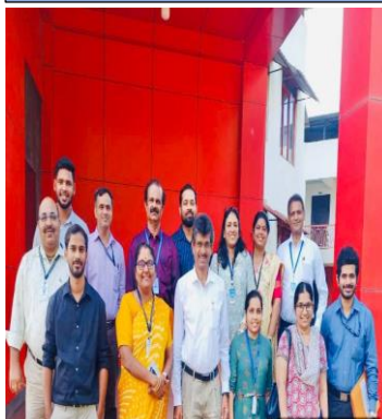
Goa University Affiliation Inquiry Committee visits the College Campus