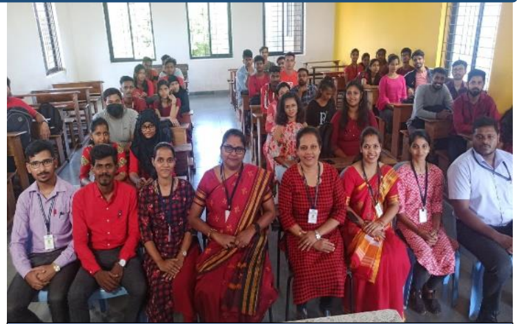
“Short-Term Certificate Course in Tally ERP 9 with GST (30 Hours/ 2 Credits)”, for the students of commerce