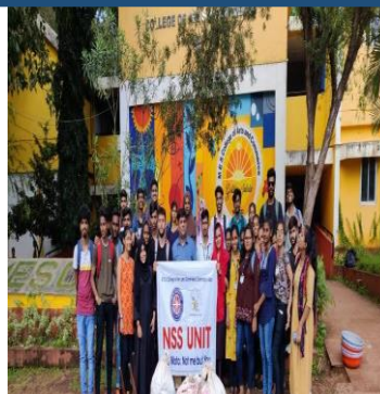
The NSS Unit of M.E.S. College organized Anti Plastic Drive as a part of NSS Day