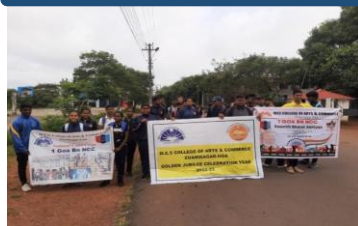
On the occasion of Gandhi Jayanti, an extension activity of Cleanliness Drive was jointly organized by NCC Army Boys Unit & Girls Unit of MES College in Vidyanagar Colony