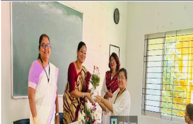
Certificate Course in Counselling Techniques organised by the Department of Psychology