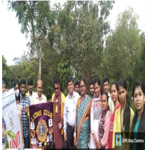
Tree Plantation drive was held at MES College