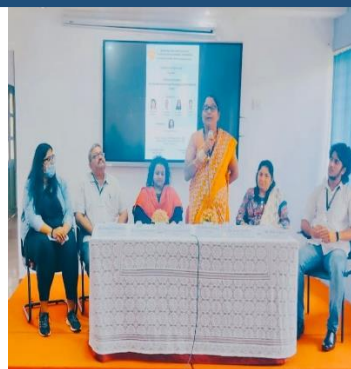
A Panel Discussion on 'Are Gender Roles Really Changing in Contemporary Times?' organised by Gender Champion Cell