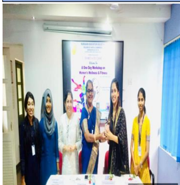
A session on 'Women's Wellness and Fitness' organised by the Women's Cell - 'Jyoti'