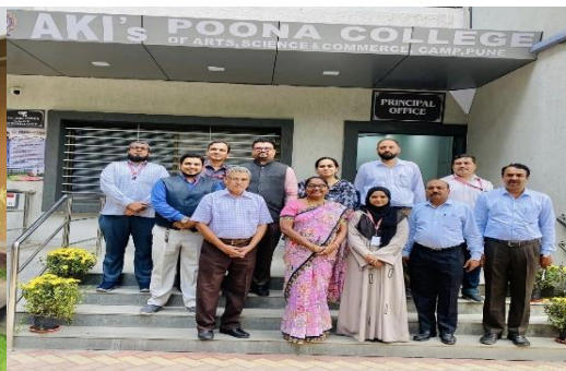
The Principal visited Poona College of Arts, Science & commerce, Pune for collaboration and linkage