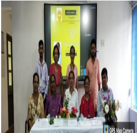
A session on Professional Ethics organised by Value Education Cell in collaboration with the NSS unit