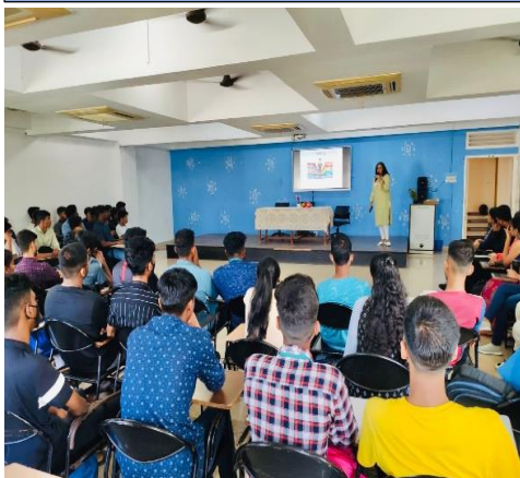
Gyan Utsav organised by the Department of BCA