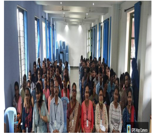
A Workshop on 'Developing A Questionnaire' was organised by the Department of Commerce for B. Com. Sem V students