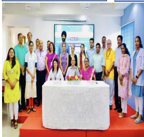
A Megafree multispeciality medical camp was conducted under Golden Jubilee celebration