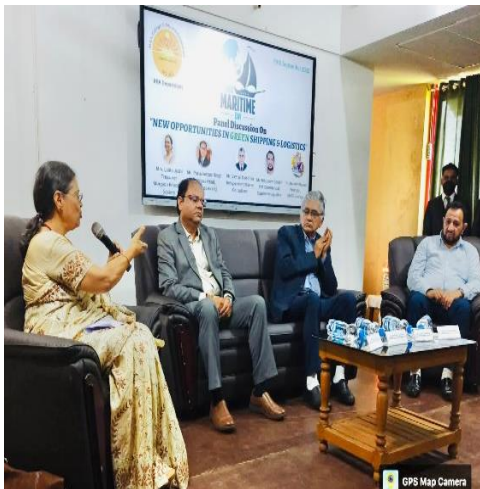
The World Maritime Day celebration by BBA Department