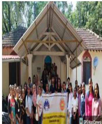
Psychology students visit to Coj mental health foundation BASTORA