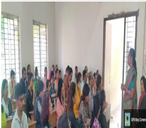
Mentoring Cell organised a session for all Class Mentors, on how to guide & mentor students