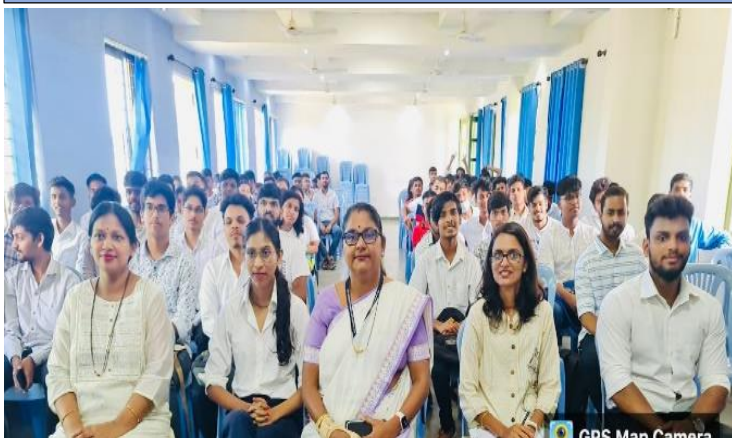
Certificate Course on Trends in Technology, BCA department