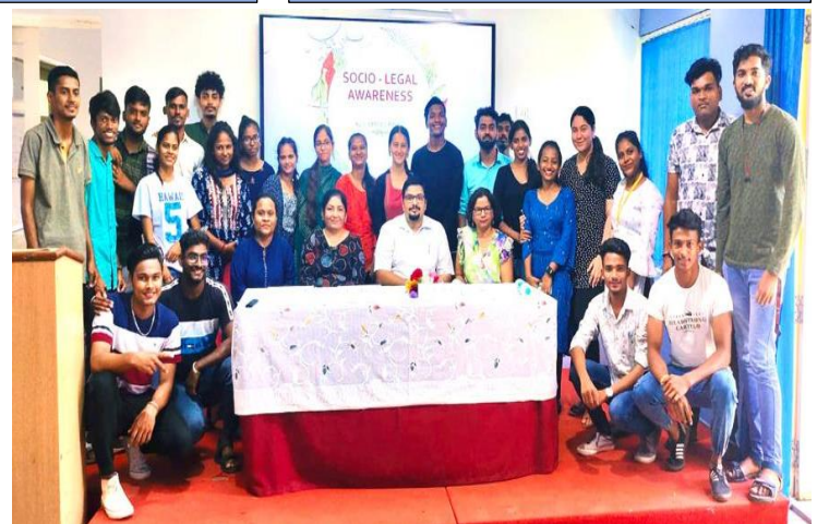
Session on Socio-Legal awareness 'My Legal Rights' organised by department of Sociology to commemorate the birth anniversary of Dr. A. P. J. Abdul Kalam