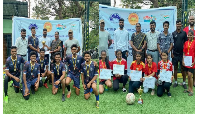
Interclass Football Tournament at MES College for B.A./B. Com. students