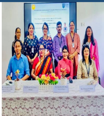
MES Alumni Association organised a session on 'Challenges Faced by Freshers in the Corporate World'