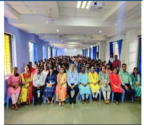
Orientation to T.Y.B. Com & B.A Project students “Identification, Research Methodology and Review of Literature”