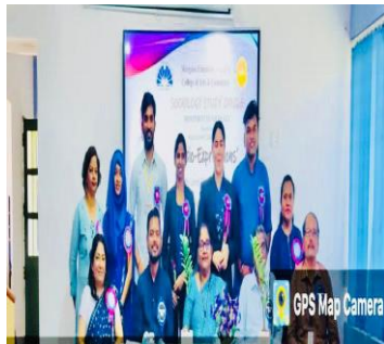
Socio-Expressions – A State level Students' seminar on 'The Role of Youth as Icons of Social Change' organised by the Department of Sociology