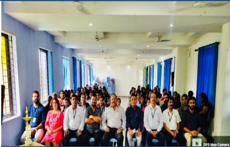
The Department of Konkani organised a 30 hours Certificate Course on Tiatr