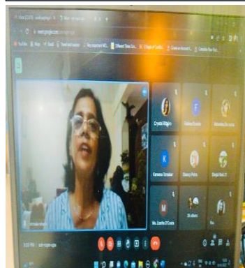
National webinar on Mindfulness conducted by the Dept. of Psychology