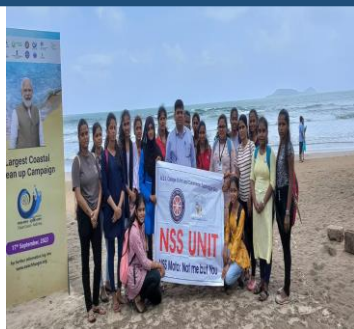
The NSS Unit conducted Beach Cleaning Activity as a part of the Swachh Sagar Surakshit Sagar initiative