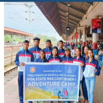
Directorate of Sports & Youth Affairs Goa State NSS Contingent Adventure Camp