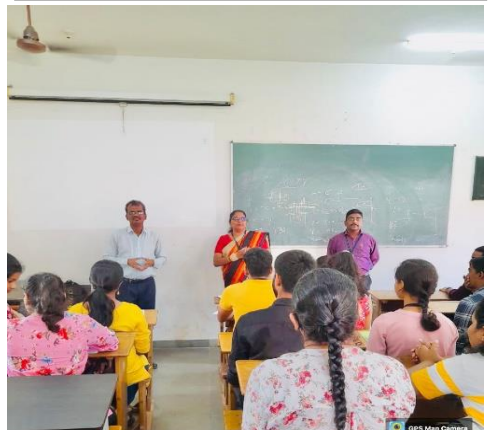
Youth Employability Program YEP conducted by TCS in association with DHE for TY students