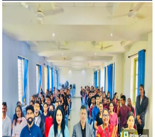
Tourism and Travel Department celebrated World Tourism Day