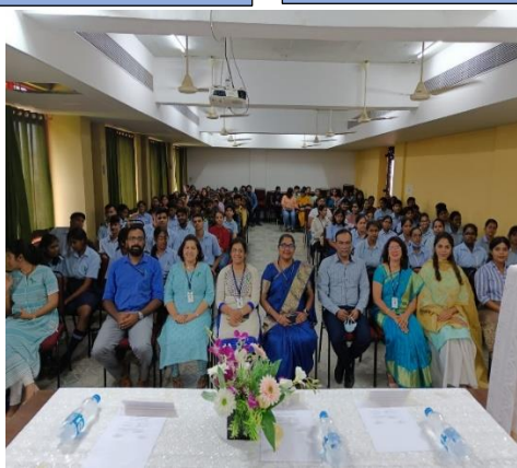
State level workshop 'Mental Health and Me' to commemorate World Mental Health day, as part of Golden Jubilee extension activity