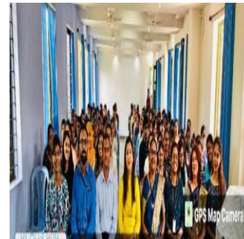
A State Level Lecture Series on Community Resilience organised by Department of Psychology