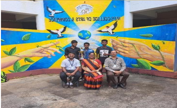
MES men's runners up, team at inter collegiate men's cross-country championship 2022, organized by Goa University