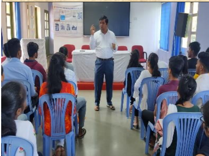
Orientation for NSS volunteers