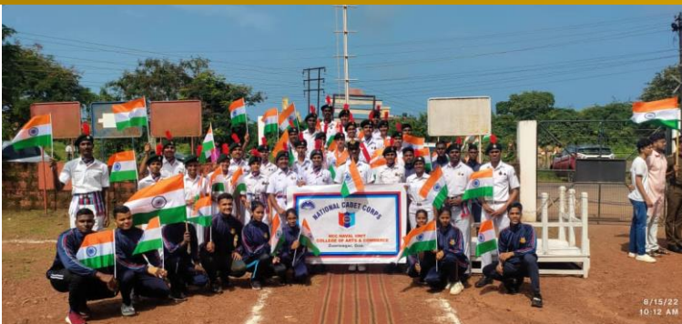
Independence Day Celebration by NCC cadets