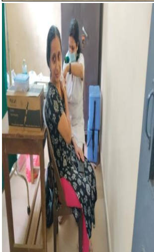
Covid vaccination for booster dose