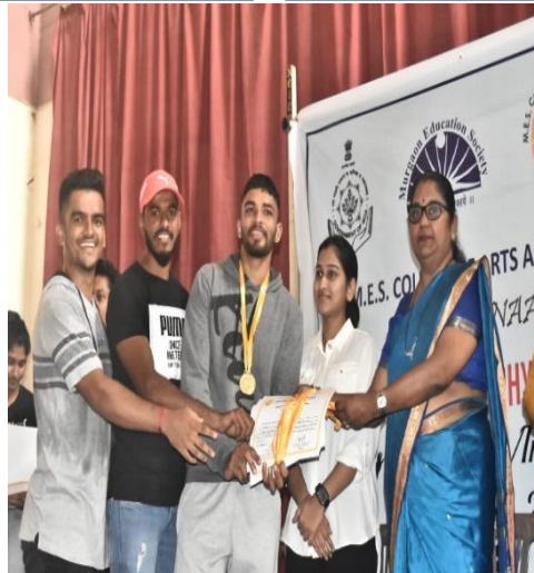
Inter class Badminton winners - TYBCOM