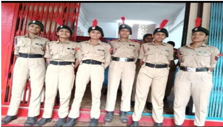
SUO and SGT attended TSC II camp in Belgaum