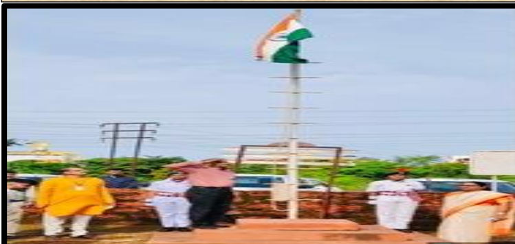
Independence Day Flag Hoisting