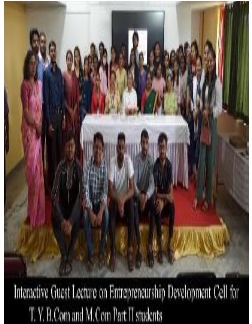
Interactive Guest Lecture on Entrepreneurship Development Cell for T. Y. B.Com and M.Com Part II students