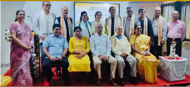
Inauguration of the Golden Jubilee Year–Felicities