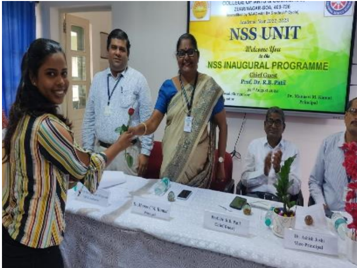
Inauguration of NSS activities for the academic year 2022-23