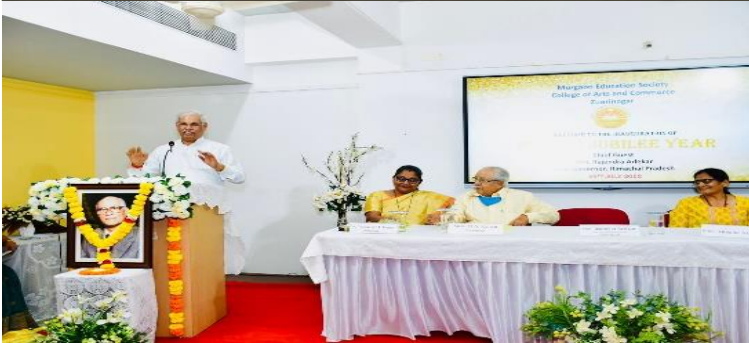
Chief Guest Shri Rajendra Arlekar, Governor of Himachal Pradesh and Alumnus of MES College addressing the gathering