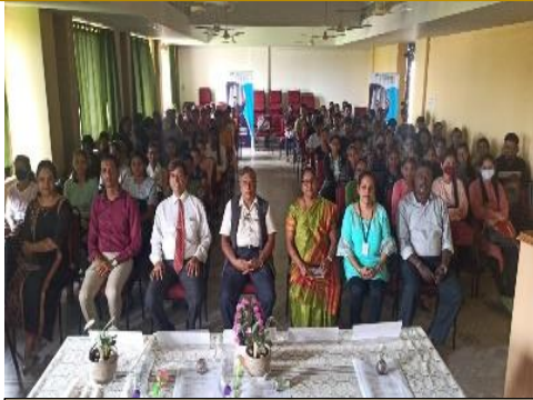
Orientation for BCom Sem I students on Chartered Accountant and Company Secretaries