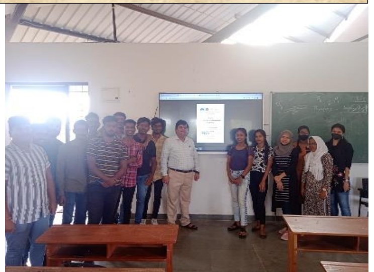
Observation of International Youth Day