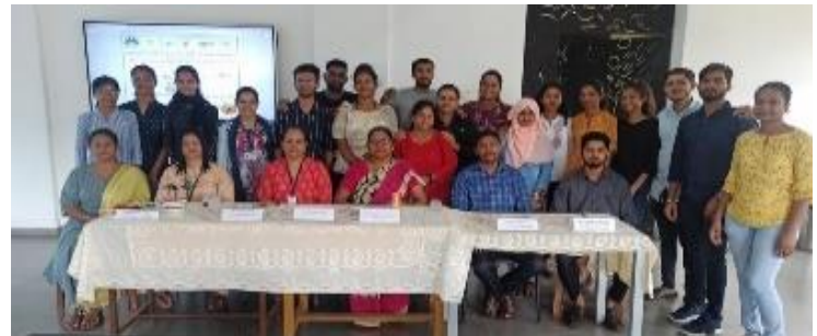
Orientation for M.Com Part II students