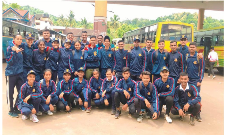
NCC Cadets participating in All India Nau-sainik camp, Karwar