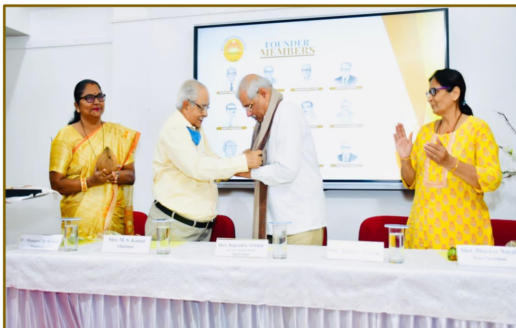
The Chairman of Murgaoon Education Society honouring alumnus and honourable Governor of Himachal Pradesh, Shri. Rajendra Arlekar