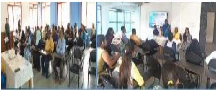
Orientation Programme for the Parents of M.Com Part I and II Students