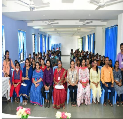
Trash to Art Competition for BCom Semester I