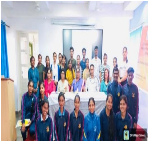
Disaster Management Training organised by GIPARD for the NSS and NCC students