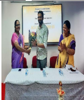
Inaugural function of BCA Batch 2022-23