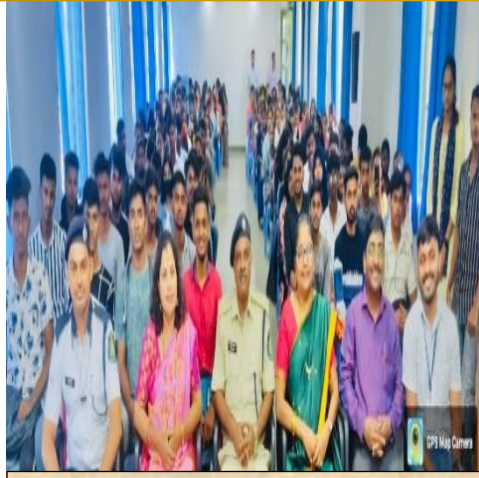
Road Safety Week Celebrated by the PTA