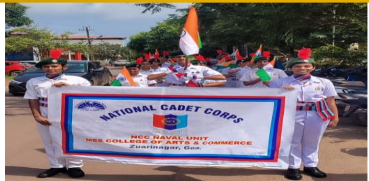
Azadi Ka Amrut Mahotsav Rally by NCC Cadets