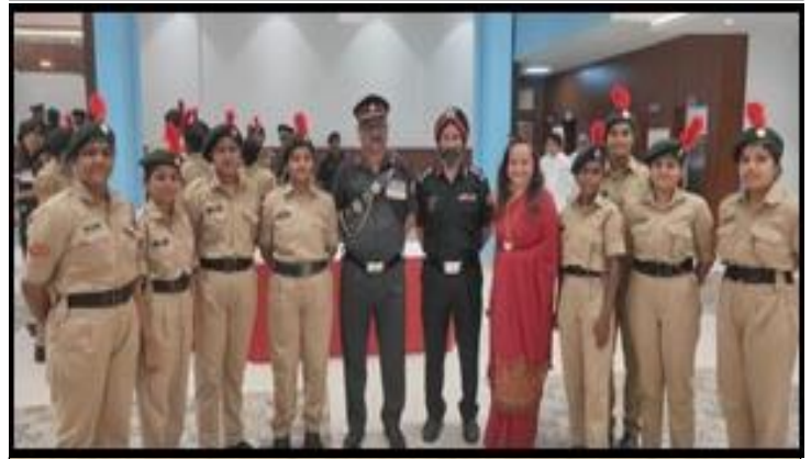
8 cadets visited Raj Bhavan to attend A Home Function