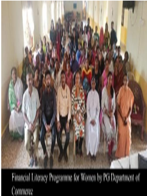
Financial Literacy Programme for Women by PG Department of Commerce