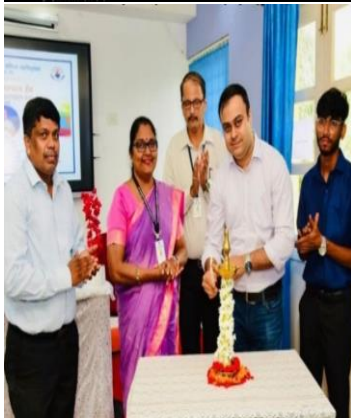
Commemoration of Konkani Recognition Day