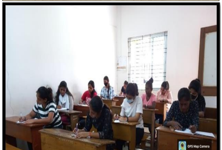
Essay Writing to commemorate Kargil Vijay Diwas for cadets