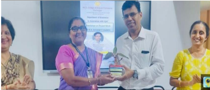
Orientation programme of for B.A. Semester V Students