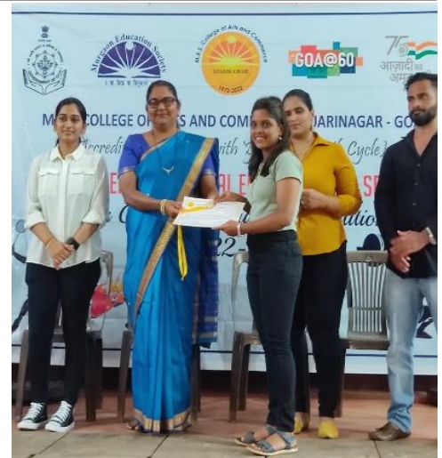
Badminton Intramural Winners (Women)