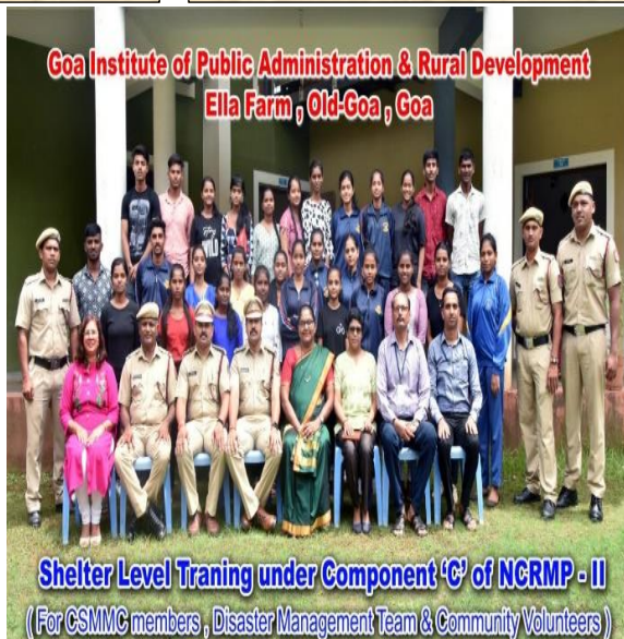
Goa Institute of Public Administration & Rural Development Ella Farm, Old-Goa, Goa