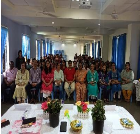
Session on journey of a successful entrepreneur for B.com Sem III, V and BA Sem I students