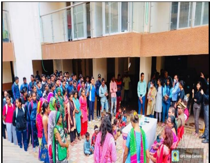
As part of 50-year celebration Ex-NCC Cadets of MES college in association with NCC unit and extension activities organise the “Joy of Giving” programme for donation of old cloths and ration to labourers