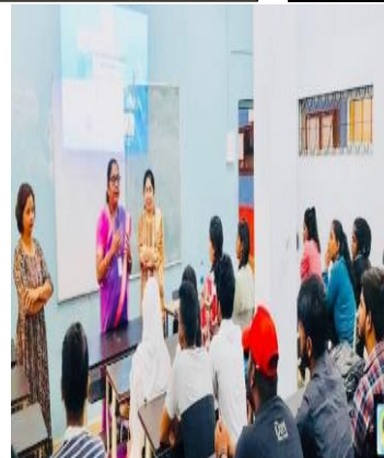
A Session on Careers in Sociology for Third Year Sociology students