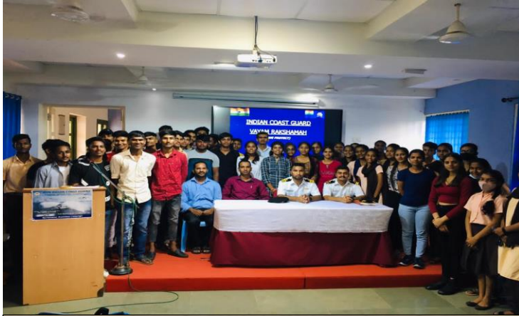
Visit of Indian Coast Guard Team to the college