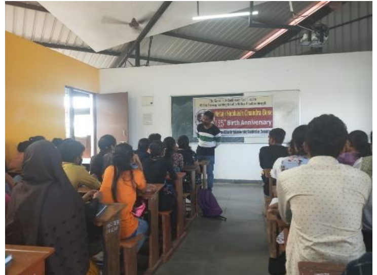
Awareness about The Life and Works of Netaji Subhash Chandra Bose