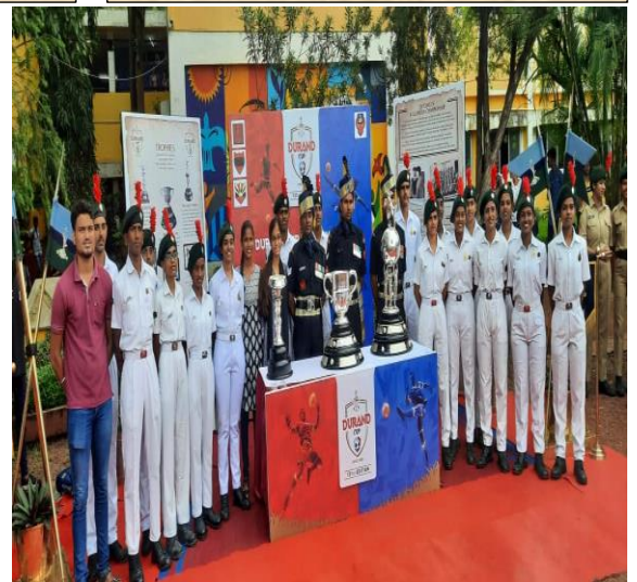
Durand Cup campaign at MES College