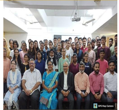
Inauguration of FYBBA and (S&L) Batch 2022