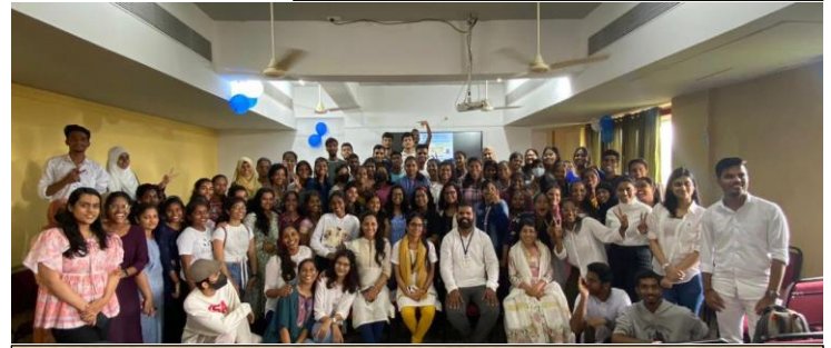
Orientation for First year B. A. English Literature students