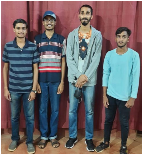
Chess Intramural Joint Third Place Winners