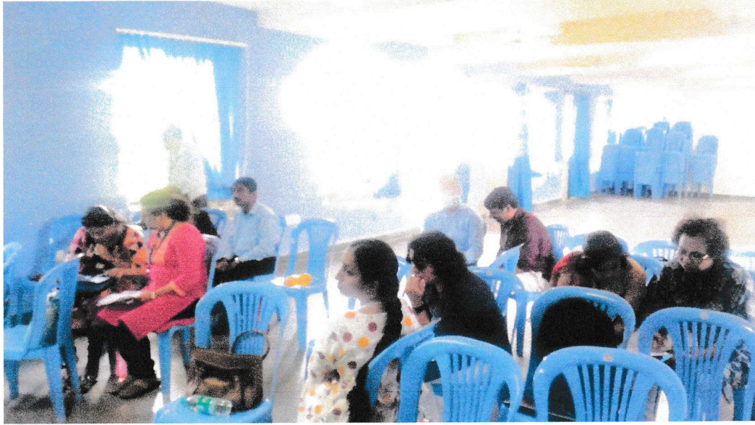
Group activity among participants at the workshop on 'Innovative Teaching Methodologies: Flipped Learning and Problem Based Learning (PBL)'