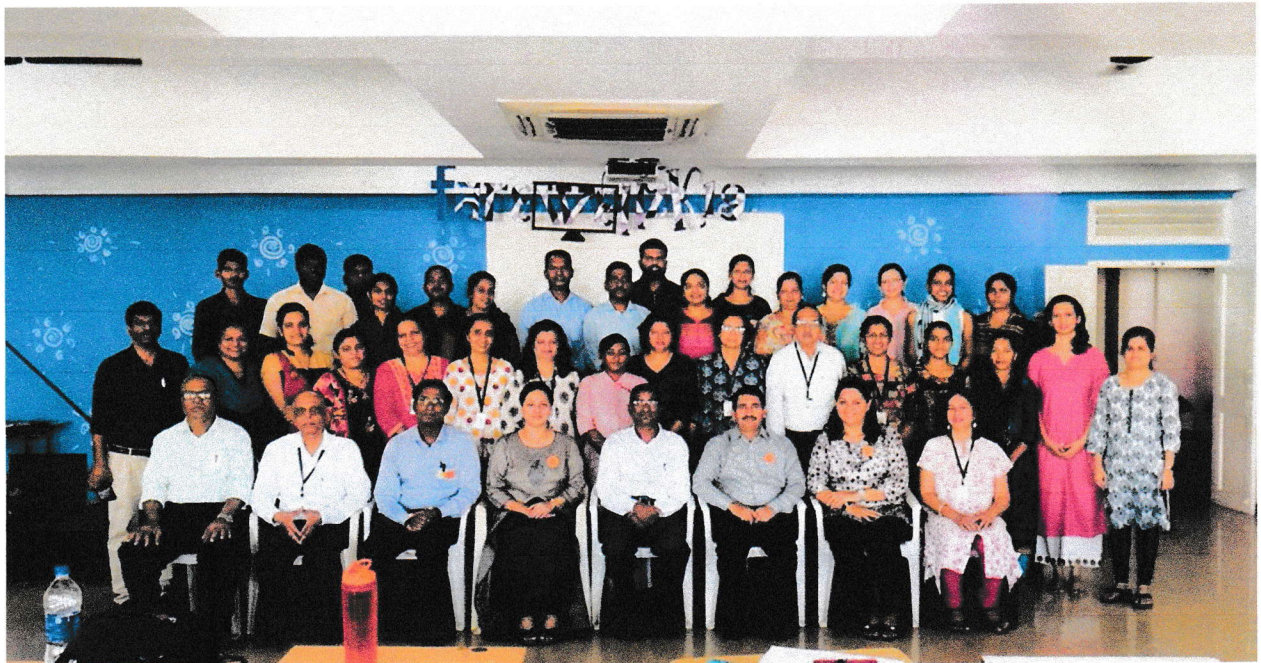
Participants at the workshop on 'Innovative Teaching Methodologies: Flipped Learning and Problem Based Learning (PBL)'