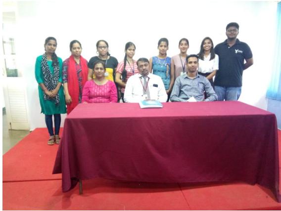
The students with the HR Manager, AXIS Bank, Chairperson and members of the Placement Cell.

08 students (2 from B.C.A, 2 from B.A and 4 from B.Com) attended the interview and all were selected for the posts of Business development executive.