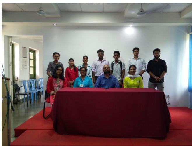
The selected candidates alongwith the HR Manager – ICICI Prudential, Chairperson and members of the Placement Cell.

After the pre-placement talk, the personal interviews were conducted and 11 students were selected.