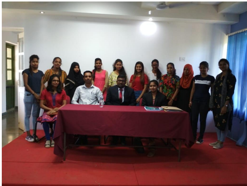
The students with the recruiters from Smart ABC as well as the members of the Placement Cell.