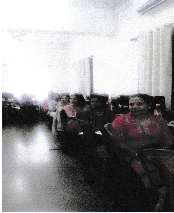
Participants at the state level Faculty Development Programme