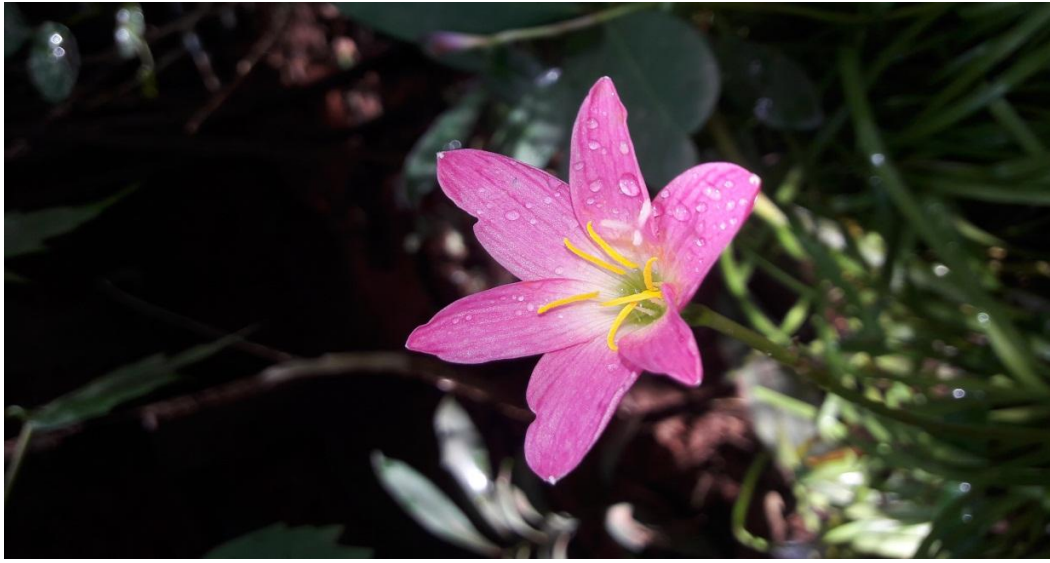
1 st prize winner