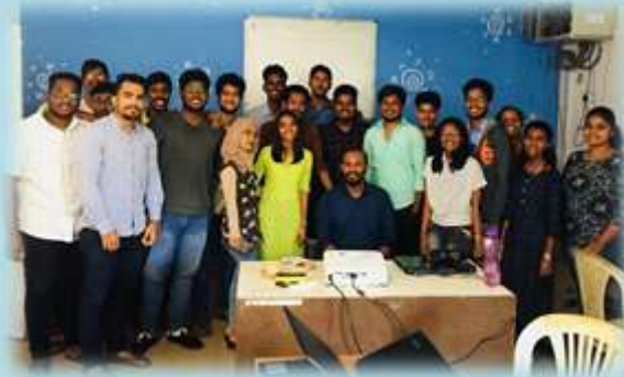
Super innovators (Software Testing Session)