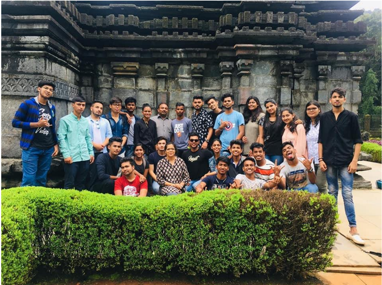
FYBBA students visited Tambdi Surla on 18 th September 2019 to study the flora and fauna as part of the course Environment Management 1.