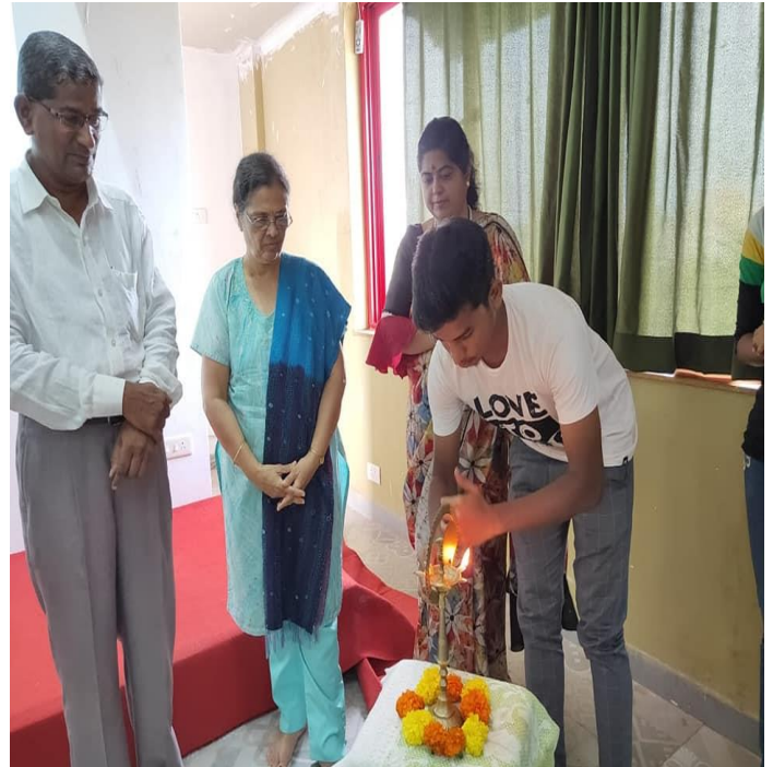
The Orientation Program was held for the students of FYBBA and FYBBA (Shipping & Logistics) and their parents on 1 st July 2019.