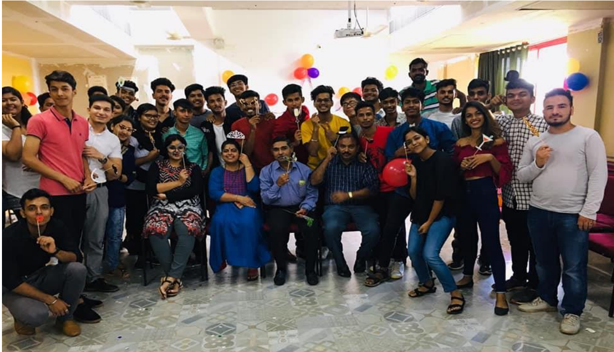
Freshers' Party was organized by the FYBBA and FYBBA (Shipping & Logistics) Batch on 20 th July 2019.