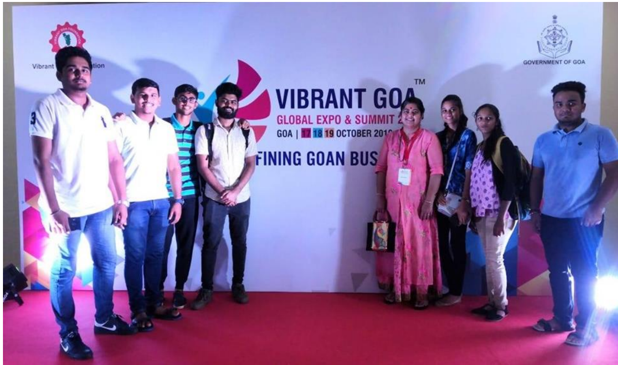
Students of BBA attended the knowledge sessions at Vibrant Goa on 18 th October 2019.