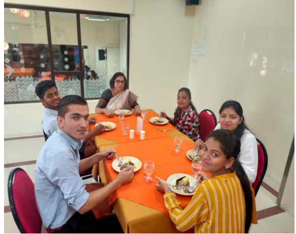
The TYBBA students were assessed (ISA) for Dining Etiquette at Institute of Hotel Management (IHM), Goa on 3 rd March 2020.