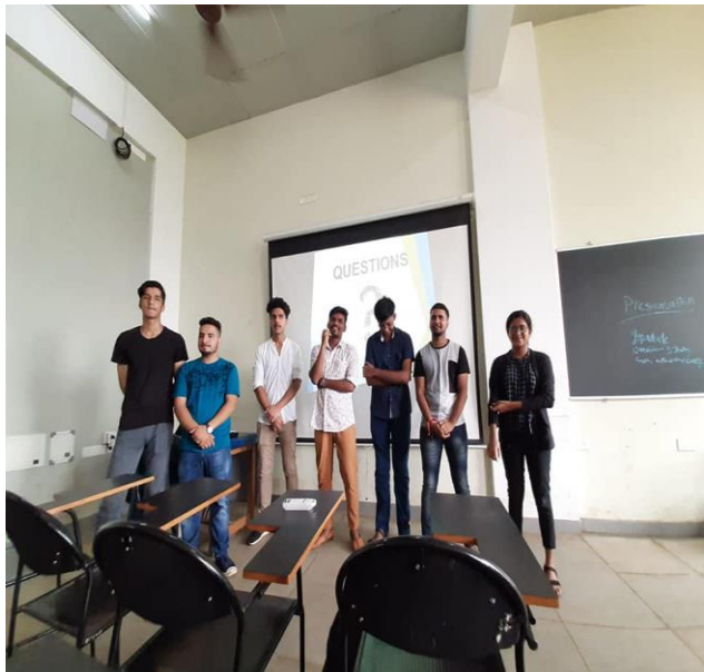
FYBBA students (batch 2019) making their group presentation for Management Process on 20 th August 2019.