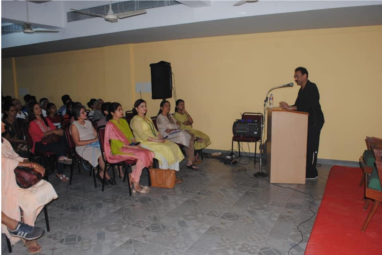
Padma Shri Wendell Rodricks conducted a session on how to integrate socially responsible practices with the business. He gave several examples from his profession wherein he contributed toward the greater good of society.