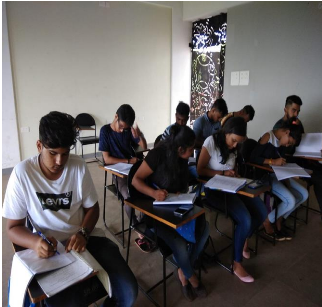
FYBBA (Shipping and Logistics) Batch 2019 doing class work. 2 nd August 2019.