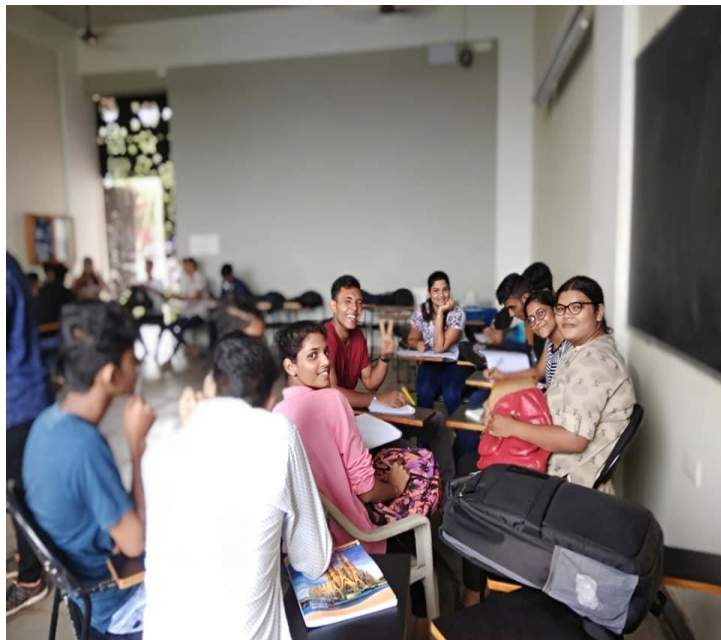
FYBBA (2019 batch) students having an ice breaking session. 9 th July 2019.