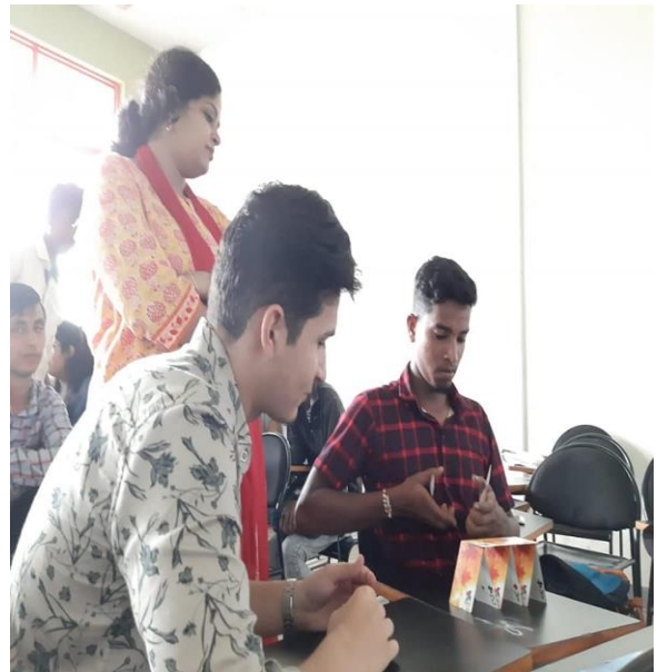
FYBBA students doing a class activity for the subject Management Process. 20 th August 2019.