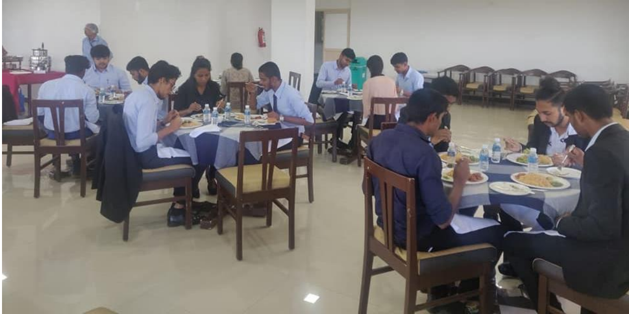
The SYBBA (Shipping and Logistics) students being assessed for Dining Etiquette at Taj Sats on 21 st September 2019.