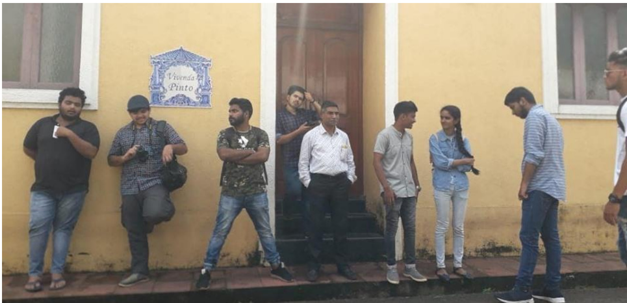
The SYBBA (shipping and logistics) students were taken to Fountainhas, Panjim for an assignment in Photography on 14 th September 2019.