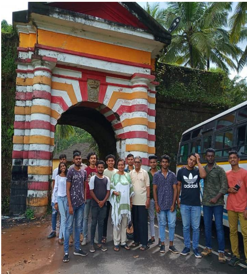
On 28 th September 2019 as part of the course Conversational Portuguese, the TY BBA (Shipping and Logistics) students were taken to the Rachol Seminary, Raia where they were sensitized to the Portuguese architecture.