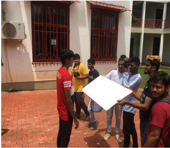
SYBBA (Shipping and Logistics) students during the photography session on 20 th Aug 2019.