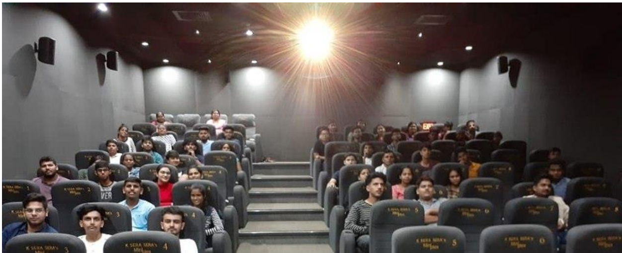
On 12 th July 2019, K Sera Sera at the 1930 Mall, Vasco-Da-Gama organised a special show of the movie 'Super 30' for the BBA students. The movie is an eye opener and sensitizes the younger generation to the difficulties which children of the lower strata of society go through, to get education. Such movies need to be shown to students in order to change the thinking of society. It also emphasizes on innovative thinking on the part of teachers to develop creative thought process in students to overcome difficult problems/ situations.