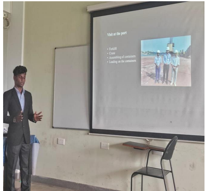
FYBBA (Shipping and Logistics) Batch 2018 - Internship Seminar on 6 th July 2019.