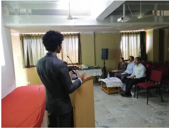
SYBBA Batch 2017 (Shipping and Logistics) Internship Seminar on 10th and 11th July 2019 being evaluated by an industry person.