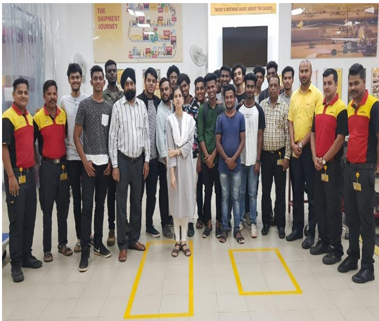
As a part of the course Air Cargo Management, the TYBBA (Shipping and Logistics) students visited the DHL Service Center at Dabolim on 18 th September 2019. They were explained all the systems used by DHL in handling the cargo.