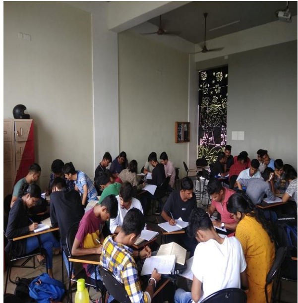
FYBBA Batch 2019 working in groups. 25 th July 2019.