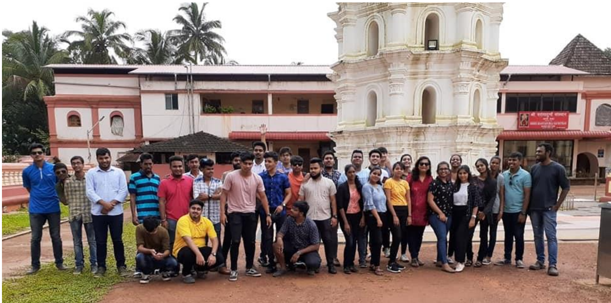
On 11 th September 2019, the SYBBA students visited important places in Goa to learn about its cultural heritage as part of the course ‘Cultural Heritage of Goa’.