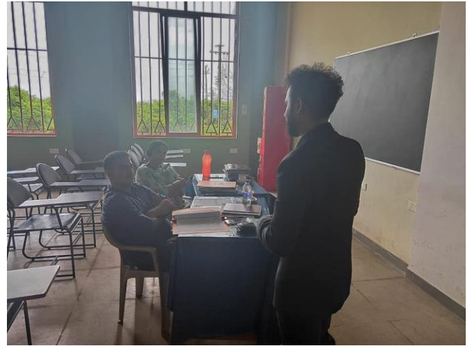
SYBBA Batch 2017 - Internship Seminars on 5 th and 6 th July 2019.