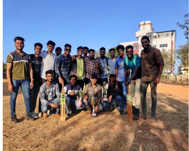
TYBBA (Shipping & Logistics) students organised an inter class Control Cricket tournament, as part of their course 'Event Management' on 3 rd and 4 th March 2020.