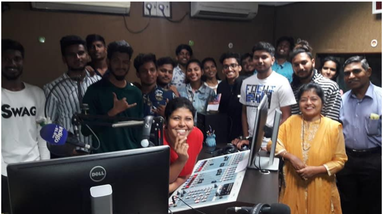
Field trip for SYBBA (S&L) to Radio Indigo and Kala Academy as part of Music Appreciation on 16 th December 2019.