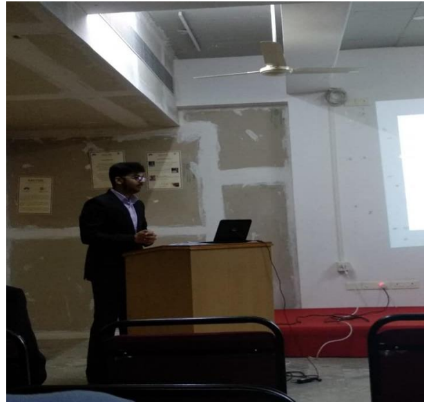
The FYBBA students of Batch 2018 had Internship Seminars on 26 th and 27 th June 2019.