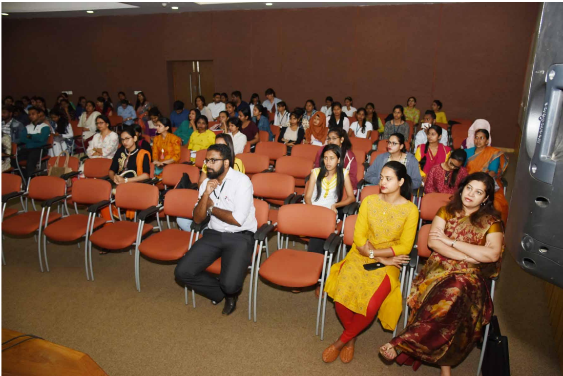
A total of 100 Audience participated in of the National Conference