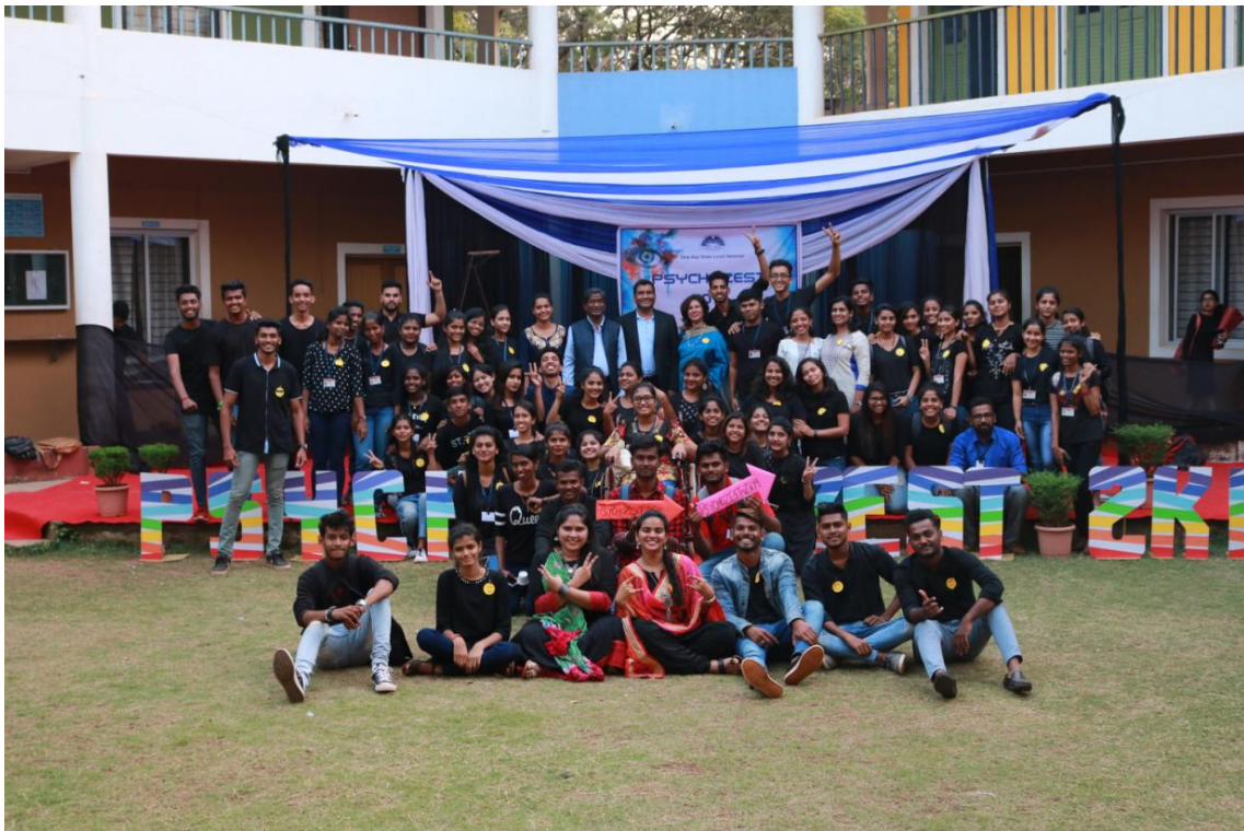
PSYCHOZEST organized by Psychology Department