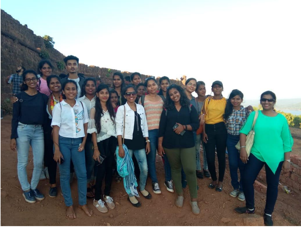
Chapora Fort, Vagator