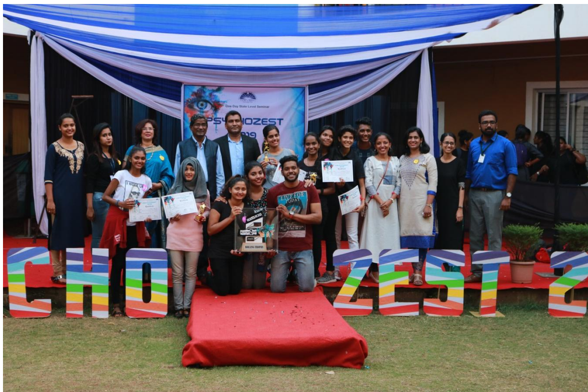
Winners of Psychozest 2019