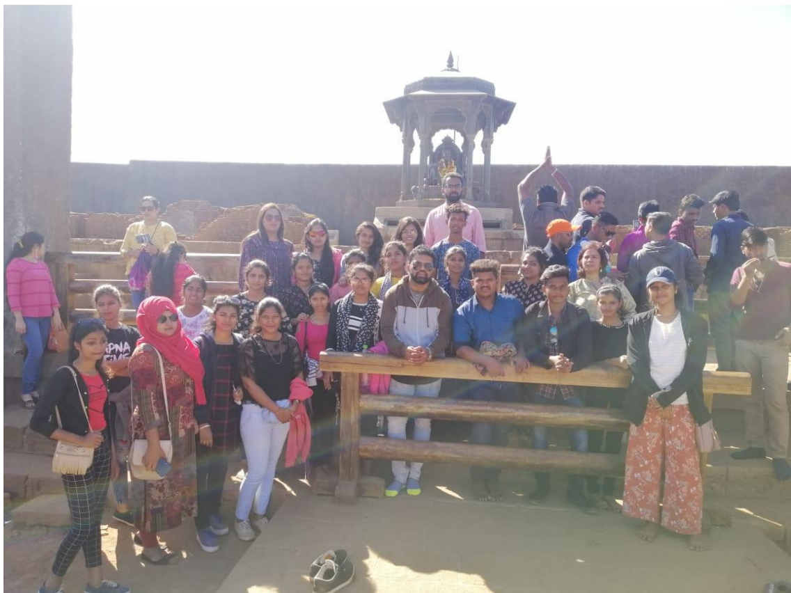
MES students visited Raigarh Fort