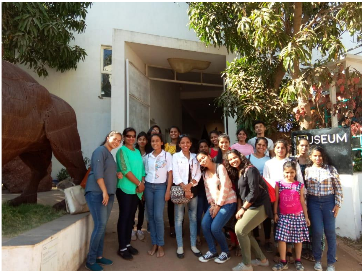
MOG Museum, Saligao