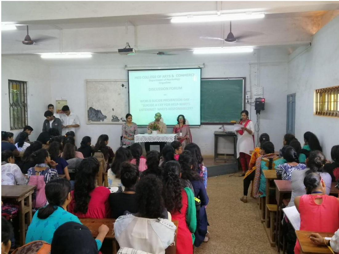
Inaugural program of the Discussion Forum on Suicide: a cry for help