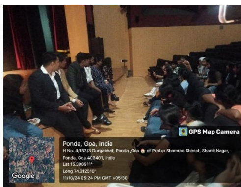
Interaction between our students and the students of the Theatre College