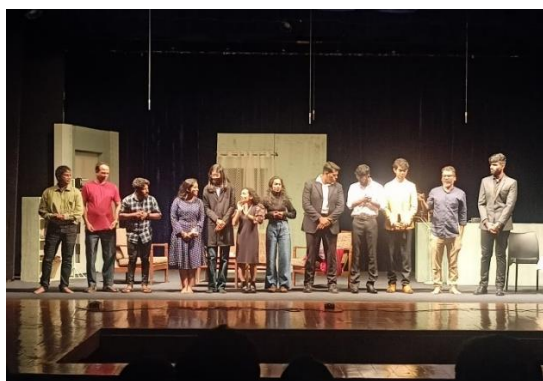
The cast and Director of the play ‘Anjumallige’