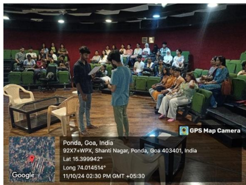
Our students witnessing the rehearsal of the play Baki Itihas

The field trip concluded with an interactive discussion between our students and the theatre students, fostering an exchange of ideas about performance techniques and the complexities of live theatre.